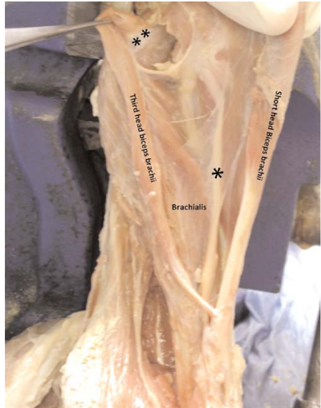
Figure 1. Photograph of cadaver specimen with three heads of the biceps brachii muscle. *Indicates the musculocutaneous nerve, **indicates the origin of the well-developed third head from the deep investing fascia of the brachialis muscle.

Two relatively large studies have categorized the origins and insertions of supernumerary heads in an attempt to identify the most frequent variations. Rodriquez-Niedenfuhr et al. [11] identified three different points of origin: superior, infero-lateral, and infero-medial. Their data is summarized in Table 2 . These authors propose that case reports of up to seven biceps brachii heads are combinations of the superior, infero-lateral and infero-medial origins with duplication of the long or short heads. [11] Our specimen does not fit into this classification system. The other classification system, summarized in Table 3 , was proposed by Kosugi et al. [34] They grouped supernumerary