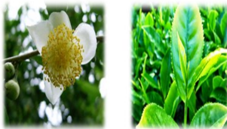
Figure 1. Green tea plant ( Camellia sinensis L.) (Guzeldir, 2015).

There are 80% polyphenols and flavonoids in the structure of green tea. Polyphenols are cyclic organic compounds bearing hydroxyl or carboxyl groups in their structures (Figure 2). Thus, they easily capture and neutralize free radicals (Sarica, 2014; Legeay et al. , 2015). The phenolic compound is found in the raw extracts of green tea which consists of catechin and flavonol glycosides. Epigallocatechin-3-gallate (EGCG) is the most abundant catechin which is the main polyphenol component of green tea, nearly 50-80% of total green tea catechins. Green tea catechins have two benzene rings known as A and B rings. EGCG has two isomers in trans configuration. In addition, it has a higher capacity than vitamins C and E in terms of antioxidant capacity (Nikoo et al. , 2018). Green tea leaves contain carbohydrates such as cellulose, glucose, sucrose, fructose, pectins, as well as proteins, minerals, small amounts of lipids, sterols, vitamins, pigments, and volatile compounds (Figure 2) (Bilcanoglu, 2019).