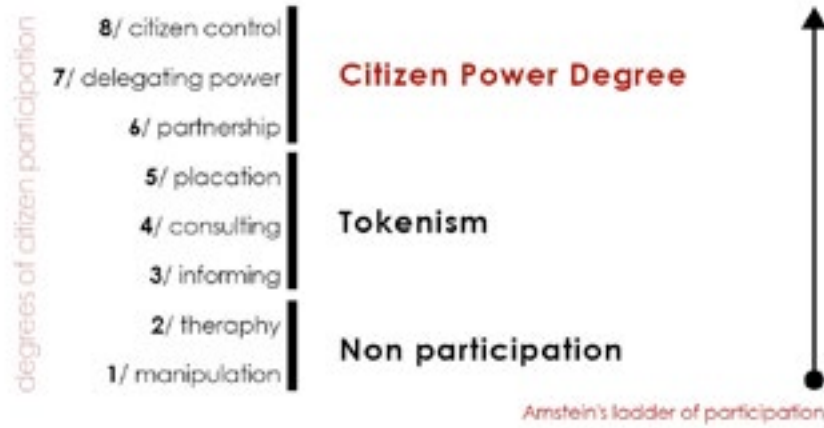
Figure 1. Ladder of participation [17]

Stakeholder Typology Analysis: The second analysis is based on the study developed by Lee regarding Lefebvre’s spatial philosophy [19, 20]. This analysis aimed to understand the relationship between the designer, the user group, and other stakeholders in the execution of the entire process, and the results at every stage of the process [2]. Interaction increases as the number of networks established by architects, users, and other actors involved in participatory processes increase. This will make interaction more meaningful.