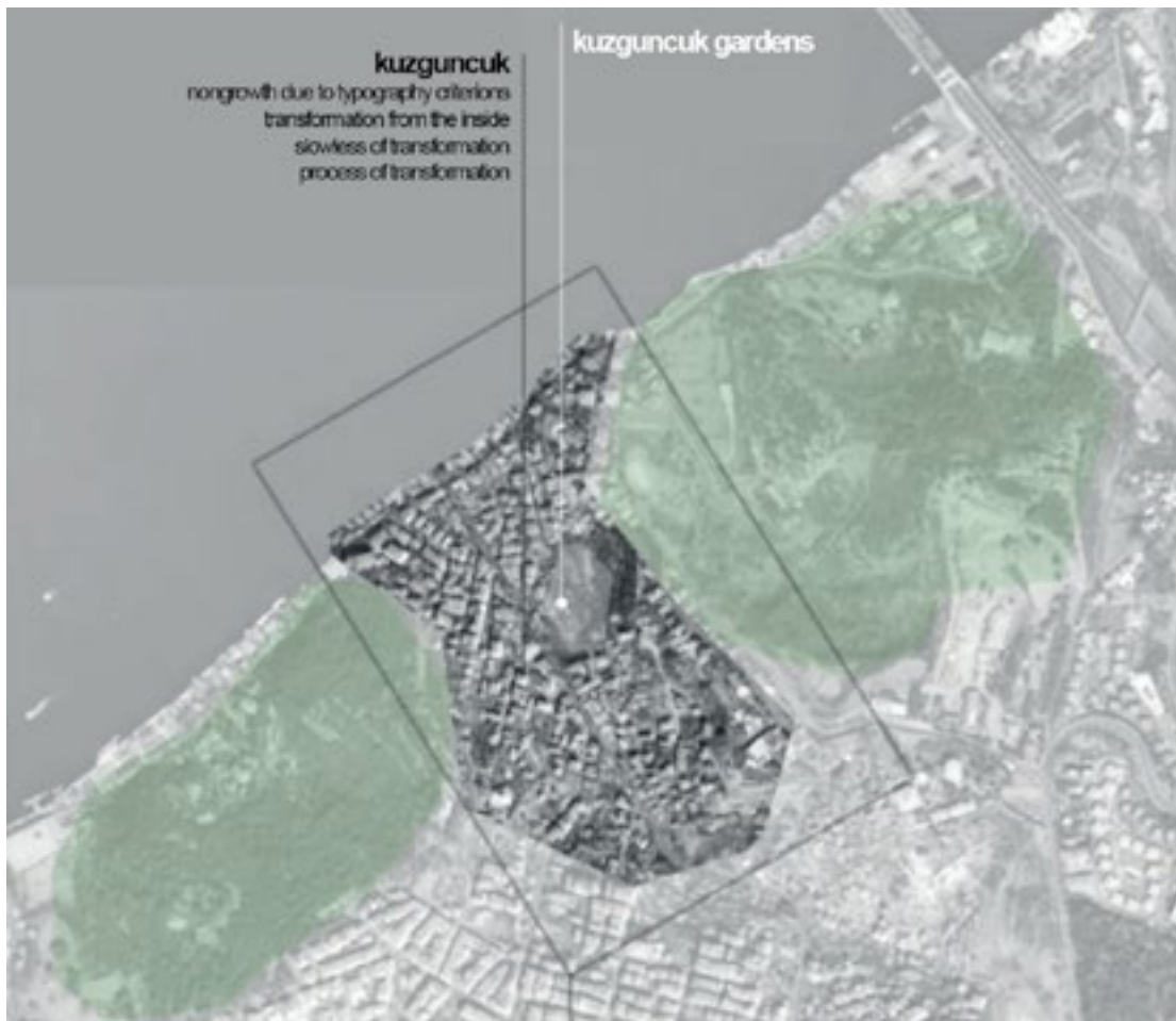
Figure 4. Kuzguncuk Gardens in the Kuzguncuk Neighbourhood [URL-1] (re-illustration by authors)

“Driven by the community initiative, the Kuzguncuk Gardens exemplify how social, environmental, and heritage values can be successfully conserved through democratic processes, including collaboration, co-operation, and mediation of participatory planning and design processes. This piece of common land was able to be revitalized to sustain the collective spirit of the community [30].