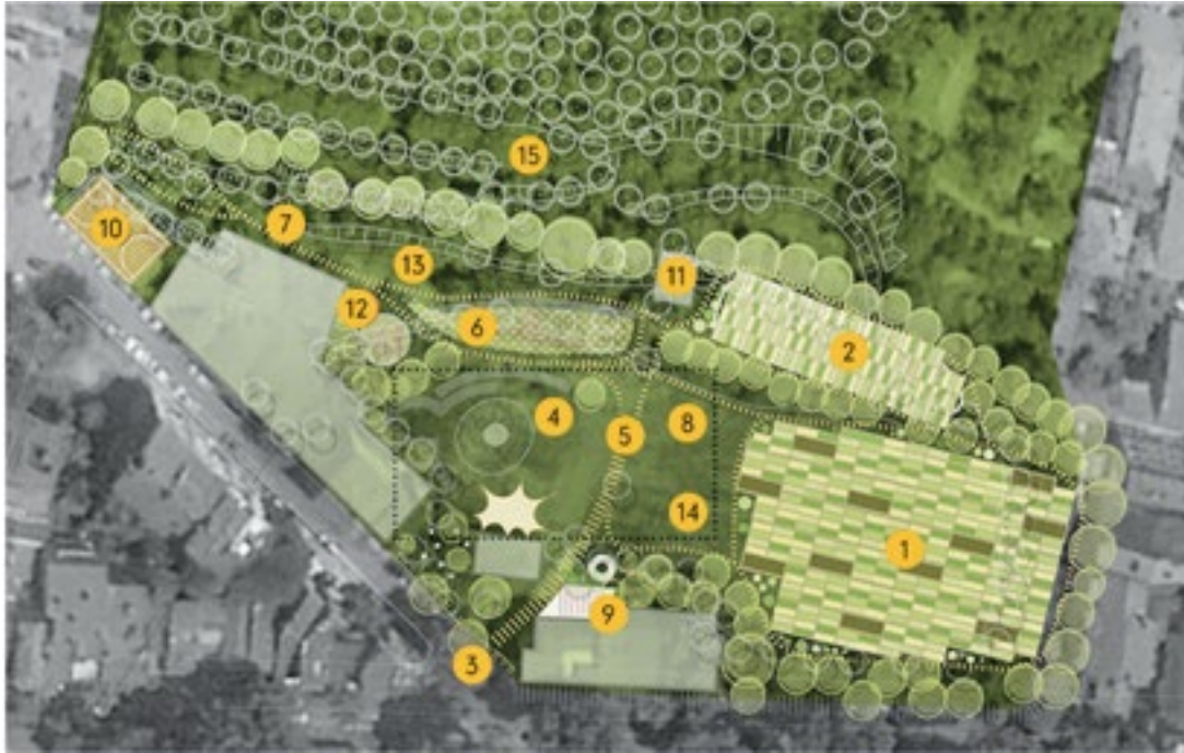
Figure 5. Site plan of the application project 1) garden (agriculture) 2) garden (agriculture) 3) entrance and service building 4) village square 5) pedestrian paths 6) playground 7) dog place 8) activity area / meadow 9) traditional water pump 10) sport field 11) library / kids' sand pool 12) kids' playground 13) recreation / exercise 14) disaster assembly area 15) natural pattern conservation region [29] [URL-2]

Dündaralp says of the Kuzguncuk Gardens project, “If this study, which focuses on the right of use rather than the right of property, can force the parties to produce alternative models that can be kept alive without losing the values of the garden, it will be able to fulfill its task successfully by moving the parties to a new area of negotiation.” The project was made possible not only by the discourse of “touching my greenery,” but also by grasping the urban dynamics of the day and opening approaches to this field up for discussion, including how its own production, social, and economic models cannot be built on a single model without losing its current value [29].