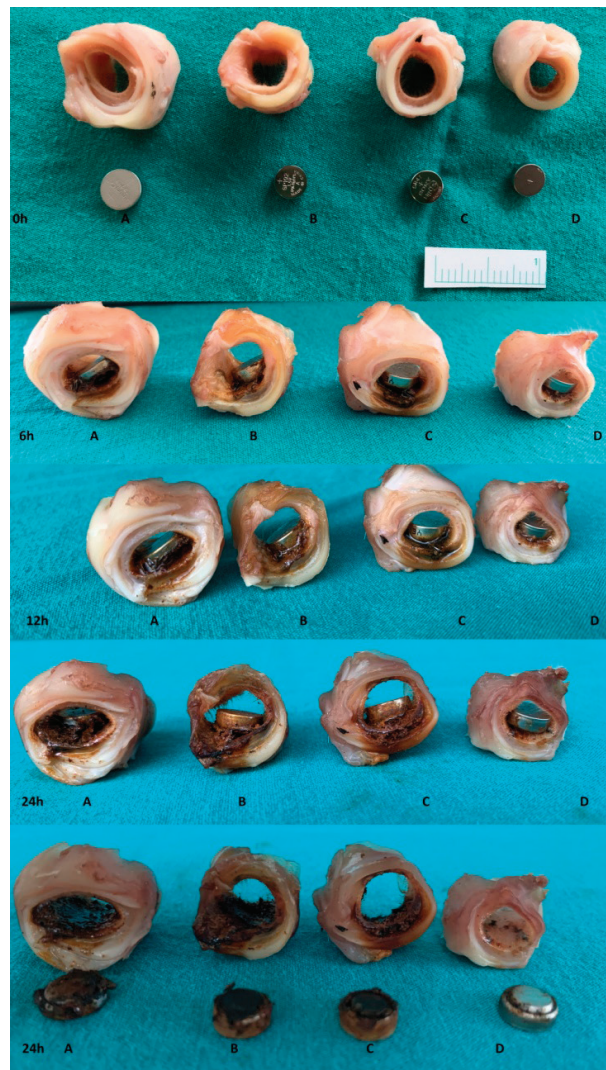
Figure 1: Visual changes of BBs at 0,6,12,24 th hours. A: Lithium, B: Alkaline, C: Silver-oxide, D: Zinc-air.

Gas bubbles and brown discoloration were observed after 1.5 hours in the EC models with lithium, alkaline, and silver-oxide BBs, and after 2.5 hours in the Zinc-air BB EC model. The least visual damage was detected in the EC model in which a zinc-air BB was placed at the end of 24 hours (Figure 1, 2).