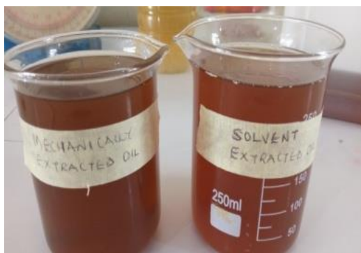
Figure 4. Sandbox seed oil.