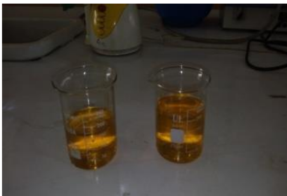
Figure 6. SBME.