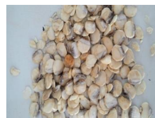
Figure 1. Sandbox fruits. Figure 2. Sandbox seeds. Figure 3. Sandbox kernels.

Sandbox oil (Figure 4) was extracted from the sandbox seed by solvent extraction method using AOCS 5-04 standard procedure. Methanol was used as the alcohol in the transesterification (Figure 5) of the oil in the presence of potassium hydroxide catalyst. The transesterification reaction was conducted at 60°C reaction temperature, alcohol-oil ratio of 1:5, catalyst concentration 0.9 g weight of oil and reaction time of 90 min. The methyl ester produced was separated from the glycerol phase and washed thoroughly. The SMBE (Figure 6) was blended with (AGO) at varying proportion, 5, 10, 15, 20, 25, 50 and 100%: diesel ratios, denoted as B100, B5, B10, B15, B20, B25, B50 and B100.