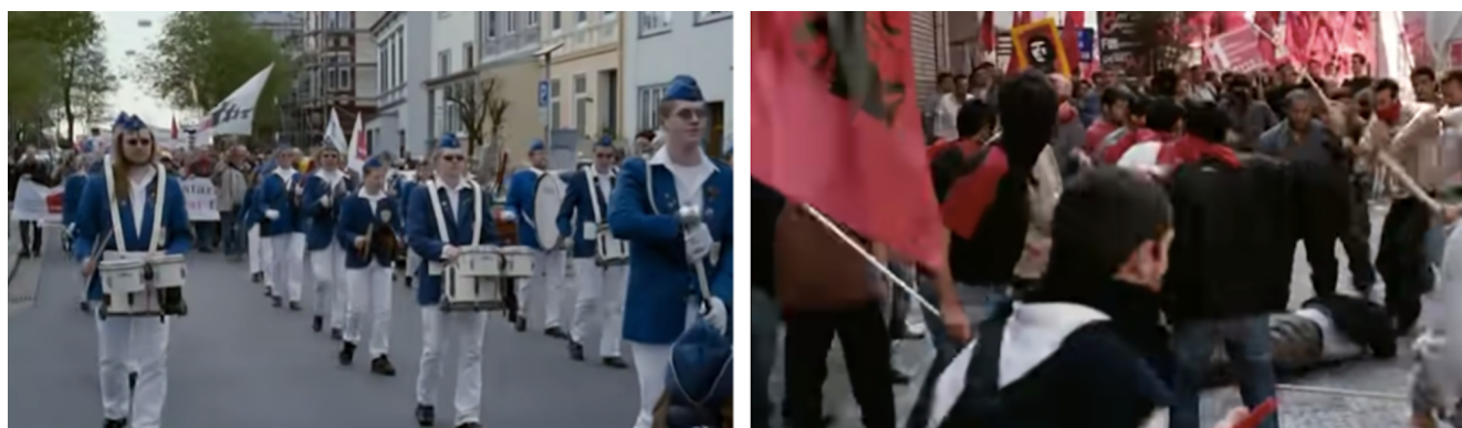
Figure 10: May Day demonstrations from Germany and Turkey

Hints of Orientalism are also given with scenes of May Day demonstrations from Germany and Turkey. In Germany, it is pictured as just another day, people and bands march with banners and slogans; no police force is ready, passers-by watch the demonstrators, and there is no chaotic atmosphere. Germany is the signifier of the Western common sense. On the other hand, May Day demonstrations in Istanbul are characterized by a dominance of political extremism and conflict signifying the chaotic Orient (Figure 10).