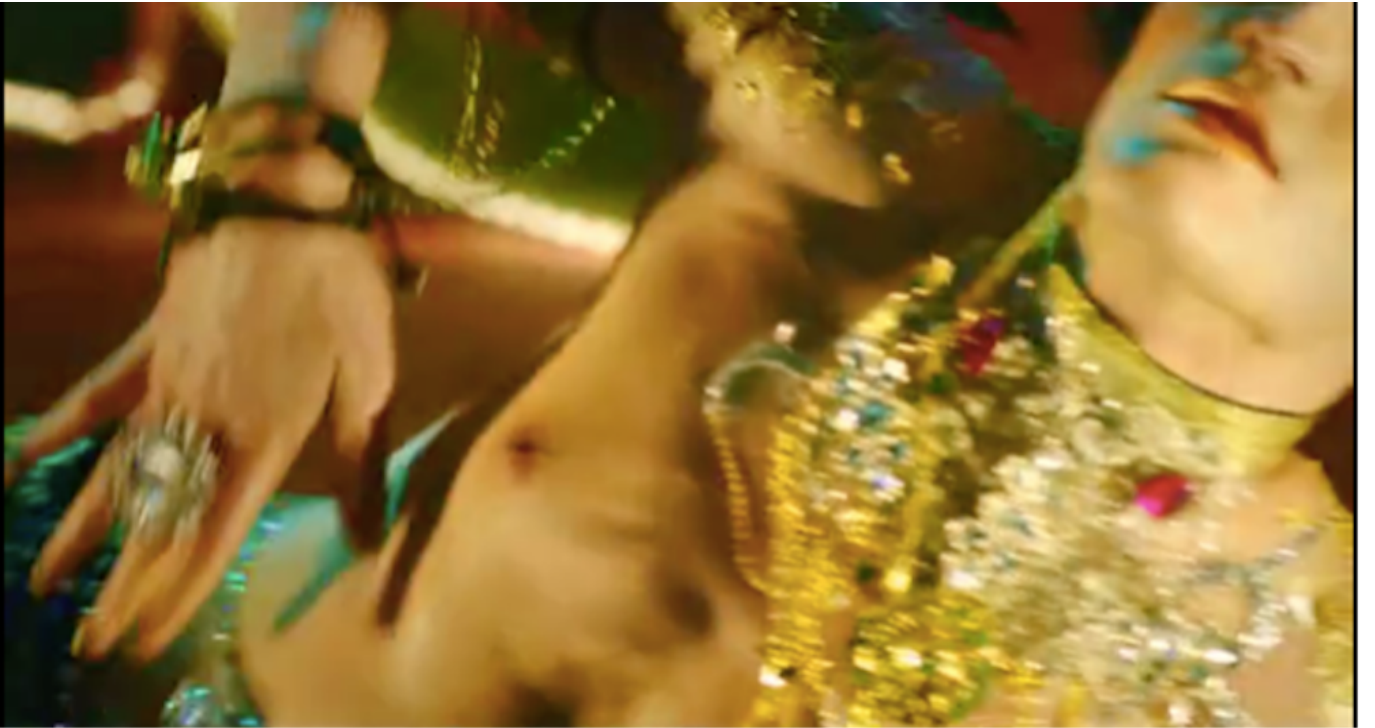
Figure 4: The dancing zenne