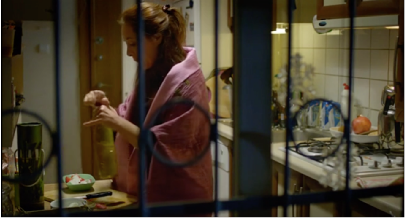
Figure 8: Can's mother behind bars on windows