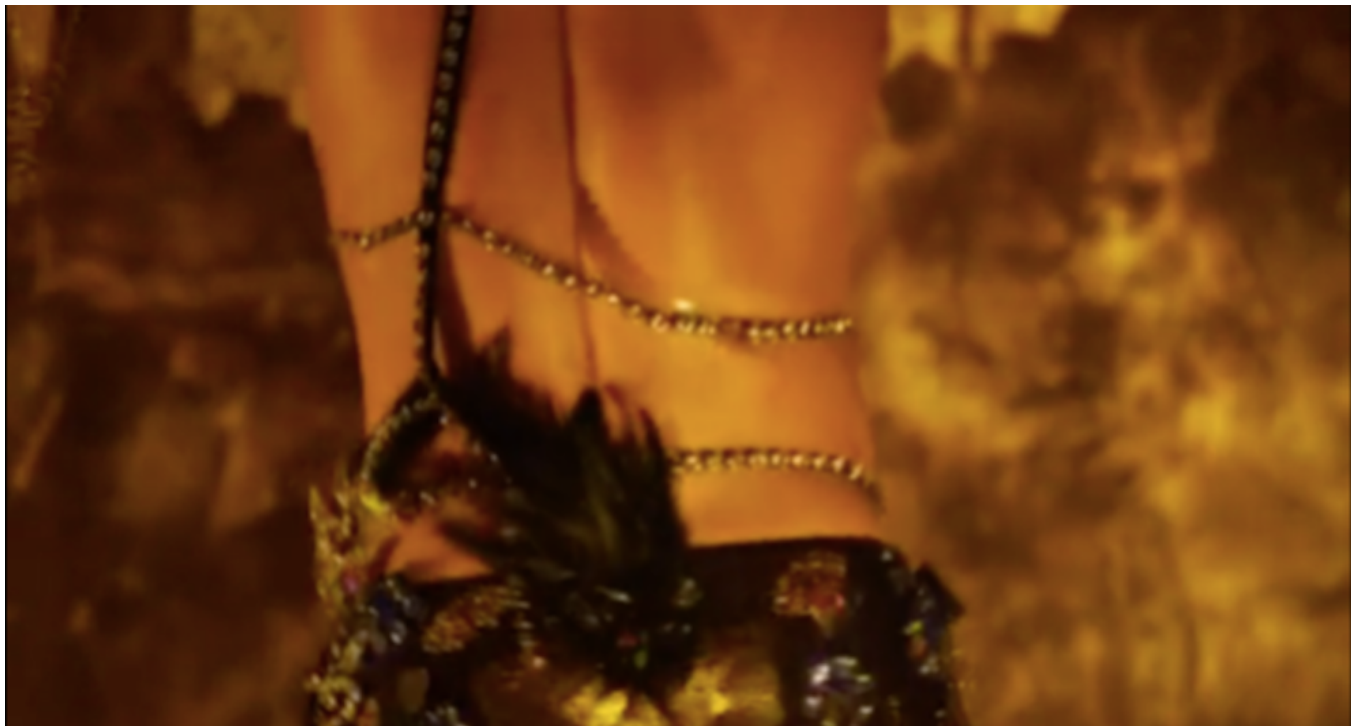
Figure 5: The dancing zenne

As other significant indicators of overall Orientalist imagery, Can's and Ahmet's beings (which signify the Orient), both as social subjects and cinematic elements are objectified, suppressed and literally incarcerated. Can's being entrapped is regularly pictured throughout the film in his dance scenes. Dancing in a cage and a rooster that he carries in a cage (See Figures 6 & 7) with himself are the other leitmotifs in the film which reinforce the idea of entrapment and complications of being the Other and a difference to the heteronormativities. Likewise, Ahmet is continually displayed as in danger and in fear. From this perspective, Can and Ahmet signify the Oriental in danger and in need of being rescued. Daniel, signifying the West, is pictured as the potential saviour of Ahmet. The Western rescue phantasy is latently at work on the same axis in both Il Bagno Turco and Zenne Dancer ; however, what is to be rescued is different: a hamam in the former, and a homosexual man in the latter.