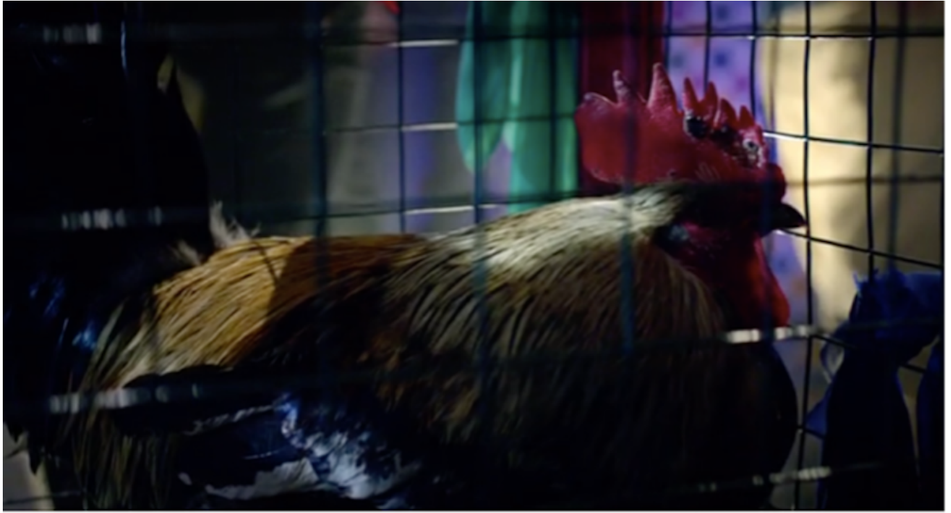
Figure 7: Can's rooster in a cage

The representation of the Oriental male characters, namely of Can, Ahmet, Ahmet's father Yılmaz (Ünal Silver), and the men Ahmet meets on the streets defies normative masculinity. On the other hand, Daniel, as the only Western male character, is portrayed going through a transformation in the Orient. And the evidence of his transformation is given with his growing a moustache on Ahmet's demand, indulging in delicious food and the beauties of Istanbul signifying the Oriental self-indulgence and jouissance, trying to speak Turkish, and the telephone conversations with Germany getting shorter. Gradually he is blended in the culture, and he starts to feel content with the person he has turned into.