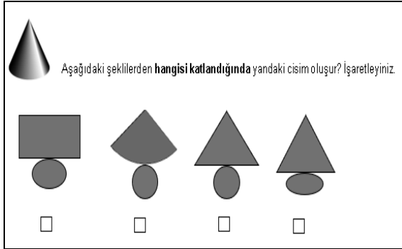
Figure 1. Establishing relationship of the two-dimensional and 3D