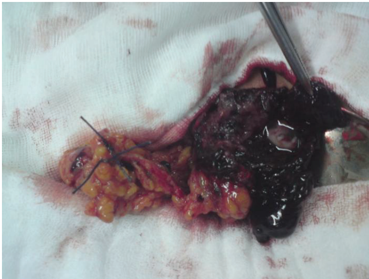
Figure 3. The view of the secondary abdominal pregnancy lied on the omentum with its fetus and placenta.

A 31-year old patient admitted to the emergency service with symptoms of abdominal pain, nausea, dizziness and 10 weeks of amenorrhea. The physical examination was performed and hemodynamic instability and tenderness and rebound on four quadrants of the abdomen were found. She had hemoglobin value of 6.1 g/dL and \beta -hCG level of >15000 mIU/mL. The transvaginal ultrasonography revealed the signs of hemoperitoneum and an intrauterine device in the endometrial cavity. At laparotomy ruptured primary tubal ectopic pregnancy and fetus with 10-12 weeks of gestational age and its placenta implanted onto the omentum were visualized (Figure 3). The right salpingectomy, partial omentectomy, and extraction of intrauterine device were performed. Three units of erythrocyte suspension and 4 units of fresh frozen plasma were given to the patient intraoperatively. The postoperative hemoglobin level was 9.2 g/dL. The patient was discharged on the third day postoperatively with an uneventful recovery to health. The histopathological evaluation resulted as right tubal ectopic pregnancy, fetus with immature organ findings, and chorion villi on the omentum.