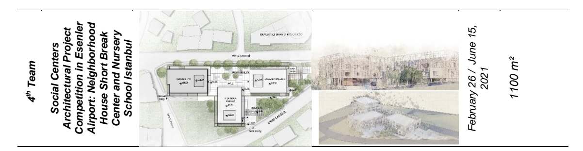
Table 3 (continued): The information about the competitions.