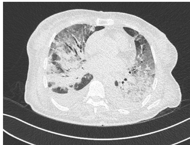
Image 2. Low dose thoracic CT prior to intubation, dated 05.10.2022.

Patients with diabetes mellitus are at risk for serious COVID-19 complications. DKA can also be counted as one of these complications. Since it was seen in previous studies that COVID-19 may present with DKA as the first symptom, it should be considered that COVID-19 may cause DKA even in patients who have not been diagnosed with diabetes before. Among DKA admissions during