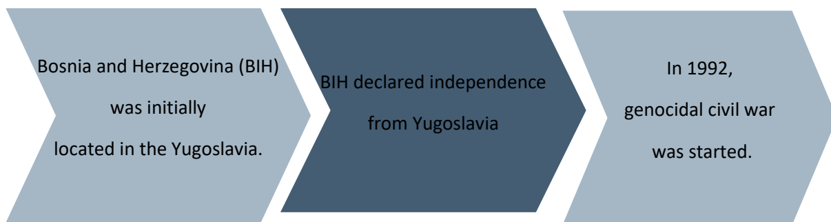
Diagram 1. Brief background of BiH

However the onset of the war in Yugoslavia reversed the situation. Individuals from different ethnic groups became adversaries to each other. The war created deep ethnic, religious and national divisions in BiH. The war destroyed the peaceful nature of the BiH which was once known for its multicultural society (McDermot & Lenohan, 2012). While former BiH was highly effective with its multicultural education, the separation between ethnicities and social changes occurring in BiH have thus created an enormous disruption in the educational system, and resulted in eliminating multicultural approaches from schooling