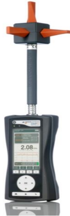
Figure 2. SMP2 electromagnetic radiation measurement device and WPT probe.

Measurements are made in mobile measurement type. Measurement device was put on a car and while car was travelling 30 km/h fixed speed, device measured electric field of the medium. Measurement instances are taken in every 5 seconds. Measurement results were shown on a map according to GPS data and field strength.