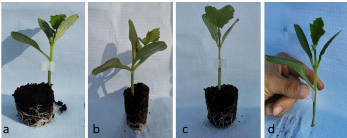
Figure 1. Grafting techniques, a) single cotyledon grafting, b) hole insertion grafting, c) tube grafting, and d) rootless grafted seedling

After all grafting processes completed, the grafted plants were placed in the post-grafting care unit, which was shaded with 90-95% relative humidity, 22-25 °C temperature and 50% light transmission shade material by spraying water on the grafted plants. three days after grafting, the shade material and plastic inoculum containers were opened in the morning and evening, this exercise was done for 7-10 days, and on the 10th day the plants were removed from the grafting unit.