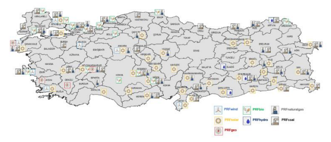
Figure 7. CRSM results

If we examine the Fig. 7, no alternative solution other than solar energy has been found for Adıyaman. However, for Istanbul, biomass and solar energy are considered hybrid energy sources. When evaluated in general, the result is that renewable energy sources are used together with coal or electricity instead of hybridizing with each other. For example, İzmir, Iğdır.