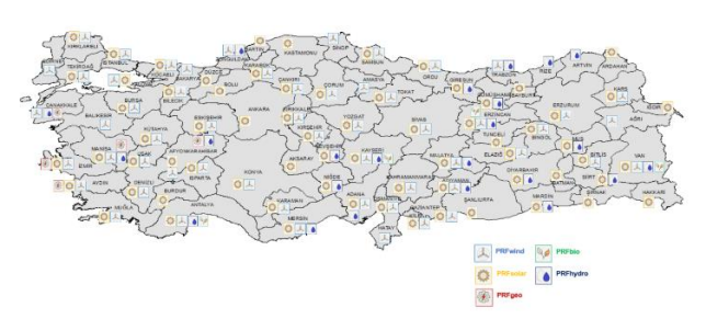
Figure 8. Hybrid solutions of TOPSIS

According to the importance levels of the criteria, the weight vector was determined as [0.4 0.25 0.25 0.1]. The "PRF value" criterion was considered as the most important criterion and the weight value was taken as 0.4. "Installation Cost" and "operating cost" criteria are of equal importance and the weight values are taken as 0.25. Finally, the criterion weight for "CO2 emission" was determined as 0.1. In the evaluation phase, if the "PRF value" of the relevant alternative is equal to zero, the relative proximity value ( CC_i^* ) of the alternative to the ideal solution is considered to be equal to zero without any calculation and the ranking is not taken into account. In practice, using the TOPSIS method for each province, 6 alternative 4 criteria have been evaluated, the relative proximity value of each alternative to the ideal solution has been calculated and the results are given in Fig. 8. In the light of this information, the relative proximity value to the ideal solution was ranked from high value to low value and the alternative with the highest value was evaluated as the best alternative.