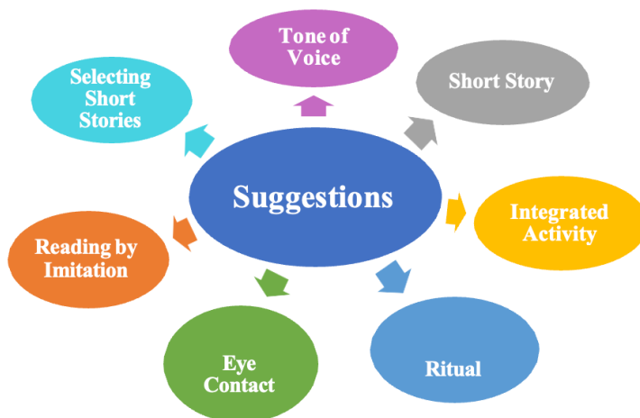
Figure 3. Views of Participants on Making Book Reading Activities More Efficient

The suggestions given by the participants to make their reading activities more productive took place under the theme of “Suggestion”. The codes of this theme were “Integrated Activity”, “Short Story”, “Ritual”, “Eye contact”, “Reading by Imitation”, “Selecting Short Stories” and, “Tone of Voice” (See Figure 3).