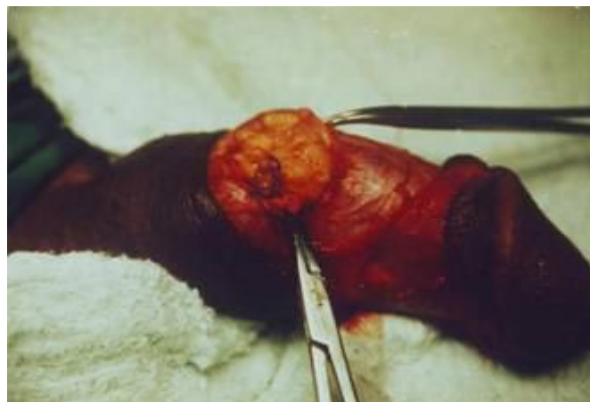
Figure 1: A right sided dark-yellow lipomatous soft tissue under the intact tunica albuginea.

Further evaluation of the patient with thoraco-abdomino-pelvic computerized tomography revealed multiple pulmonary metastases. On histopathological examination, a neoplasm composed of fusiform cells with bizarre nuclei and prominent nucleoli with areas of mixoid stroma and storiform pattern was seen (Figure 2). Immunohistochemically, the lesion was negative cytokeratin, S-100 and Desmin. As it was both vimentin and alpha-1 antichymotripsin positive, it was interpreted as a malignant fibrous histiocytoma. Systemic chemotherapy was initiated with Adriamycin ( 50 \text{ mg/m}^2 ) i.v. on day 1 and Ifosfamide ( 5000 \text{ mg/m}^2 ) i.v. continuous over 24 hours with Mesna protection cycling every 21 days. After 6 cycles of chemotherapy, the metastatic lesions in the lung decreased significantly in size. so that only some milimetric lesions were apparent on a CT scan. However, there was no change in the penile lesion. The patient underwent a palliative penectomy which revealed positive surgical margins. Just after penectomy the disease recurred in the pelvis and in the lungs and the patient died soon after, before chemotherapy could be initiated again.