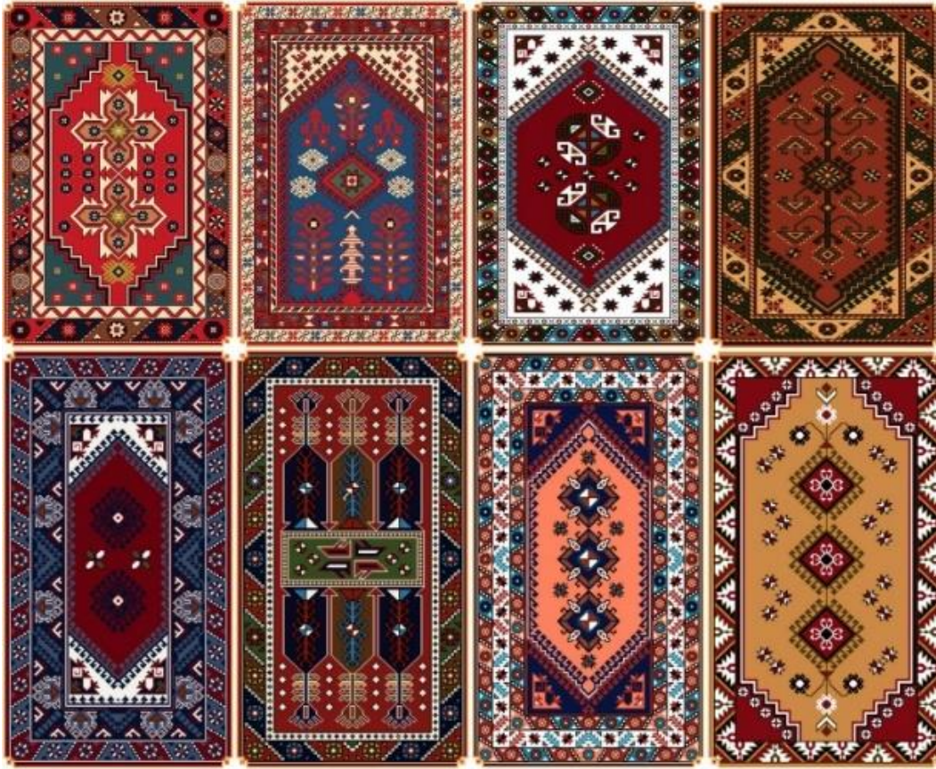
Figure 2. Döşemealti carpet samples included in the traditional Turkish carpet art (Apgem, 2012)

The research was carried out in 3 stages.