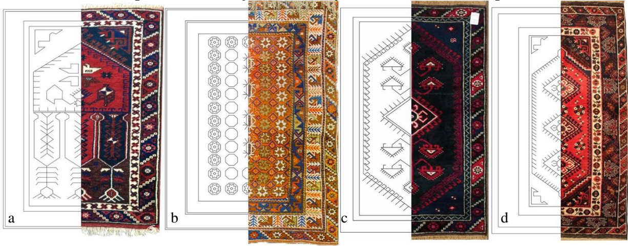
Figure 3. a. Camili, b. Yıldızlı, c. Dallı, d. Akrepli (Apgem, 2012)

mihrab is more commonly seen on runners and mats. “Dallı, Toplu, Akrepli Toplu and Yastık Yanışlı Toplu” carpets are included in this group (Sirin, 1994). As with all Anatolian carpets, Dösemealti carpets get their name from the floor arrangement. This nomenclature is made either according to the floor motif or according to the floor composition (Turkey Culture Portal, 2021) (Figure 3).