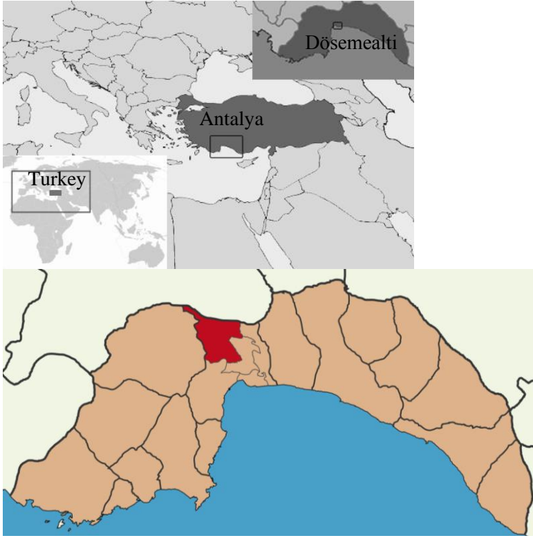
Figure 1. Location map of the research area (Anonymous, 2022)

The history of the Döşemealti region dates back to the Paleolithic Age (600.000-100.000 BC). Karain and Oküzini caves located near the village of Yagca provide information about the life levels of the first human communities living in the region. Archaeological excavations in the Gökhöyük and Bademagaci mounds in the district belong to the Neolithic and Mining ages (BC.3000-1200) (Döşemealti District Governorship, 2021).