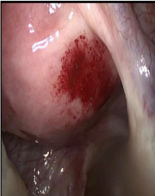
Figure 3. Ecchymosis on the posterior side of the uterus at laparoscopy