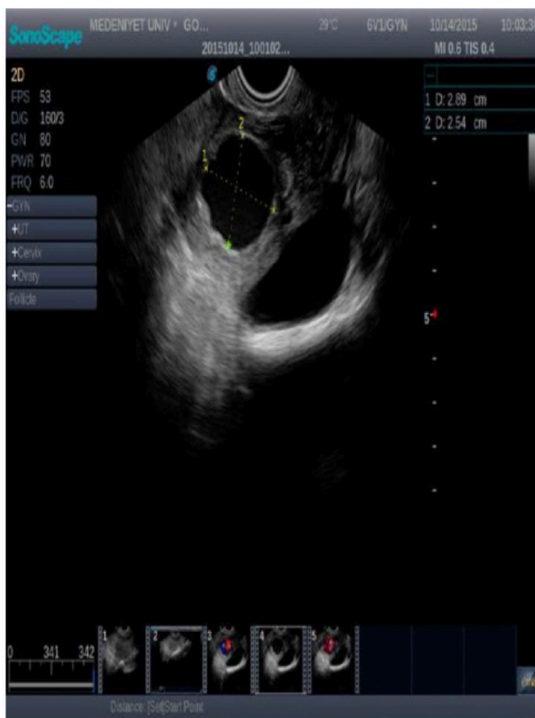
Figure 1. Ultrasound image of the uterine AVM at the time of diagnosis.

cranial MRI. Two cycles of methotrexate were initially given one week apart (25 mg/m 2 ), with increasing levels of \beta -HCG. After that, a combined regimen of methotrexate (40 mg/m 2 ) and folinic acid (0.1 mg/kg) was given within a week. However, she developed resistance. Finally, she responded completely to five cycles of multi-drug EMA-CO (etoposide, methotrexate, actinomycin-D, cyclophosphamide, vincristine) chemotherapy. After completion of the treatment, her \beta -HCG levels were undetectable. Although her \beta -HCG levels remained undetectable, the patient complained of intermittent profuse uterine bleeding episodes that required packed red blood cell (RBC) transfusions to restore low hemoglobin values. She was admitted to the clinic with life-threatening uterine bleeding six months after chemotherapy. Upon initial examination of the patient, transvaginal US showed a 29 mm \times 25 mm anechoic cystic mass in the posterior Wall of the uterus (Fig.1) and high velocity multi-directional blood flow was demonstrated within the lesion on Doppler examination (Fig.2). She had a hemoglobin value of 4.9 g/dl and four units of packed RBCs were immediately transfused. Contrast-enhanced pelvic MRI revealed hypointense, lobulated formations without evidence of prominent