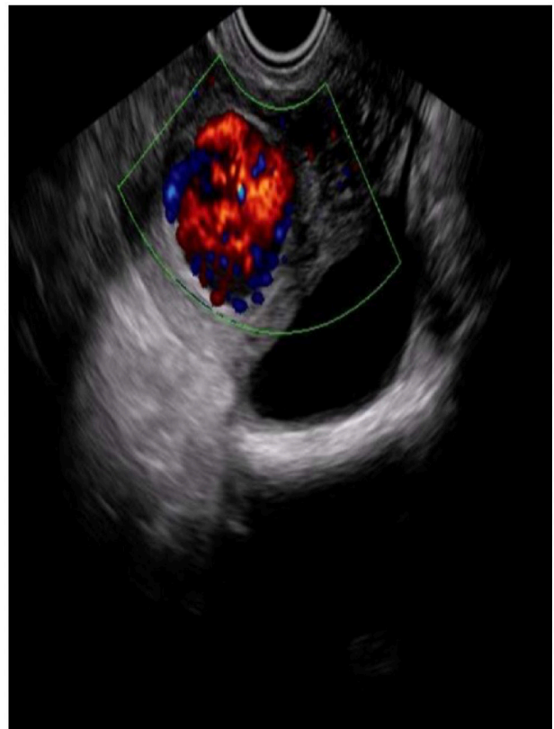
Figure 2. Color Doppler analysis illustrating high velocity multi-directional blood flow within the cystic lesion