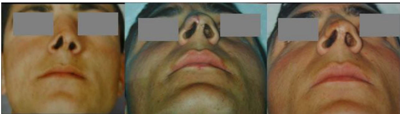
Figure-2: Basal view of right nasal alar defect: preoperative (left), one month postoperative (middle), ten months postoperative (right).