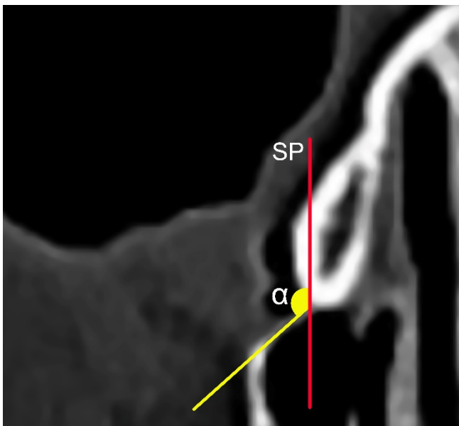
Figure 3. The angle between the lacrimal bone and the sagittal plane at the middle plane ( \alpha ). SP: Sagittal plane

All statistical analyses were performed using IBM SPSS Statistics Version 20.0 statistical software package (SPSS Inc.,