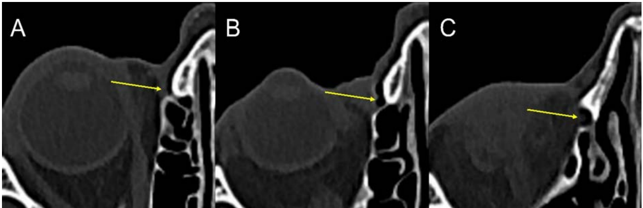
Figure 1. Axial-section images of the right lacrimal sac fossa. Arrows are showing the right lacrimal sac fossa. A: Upper plane. B: Middle plane. C: Lower plane.