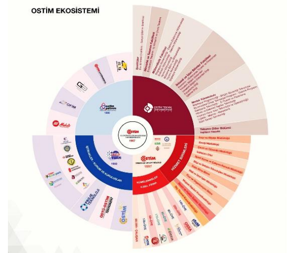
Figure 2. OSTIM Model