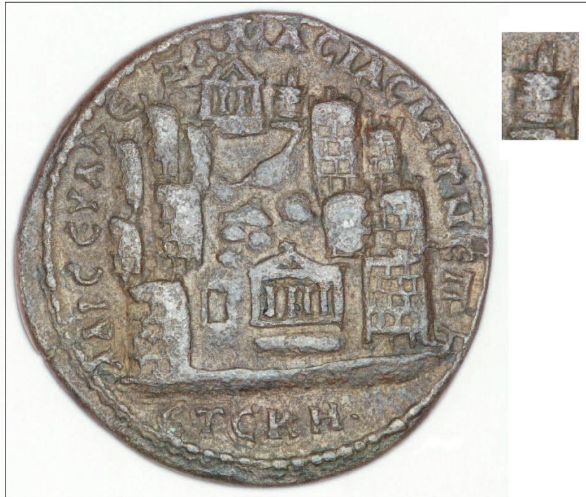
Figure 3: Bronze coin minted in Amasya and detail of the fire altar (After Dönmez, 2013).