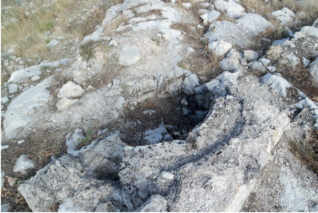
Figure 2: Round-shaped pedestal cavity from Amasya-Harşena Fortress (After Dönmez, 2013).