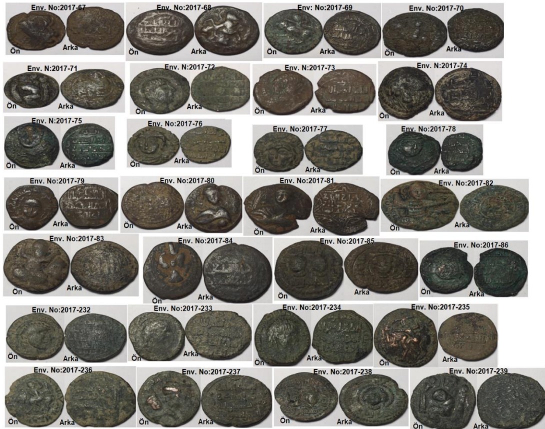
Figure 1. Photos of Coins