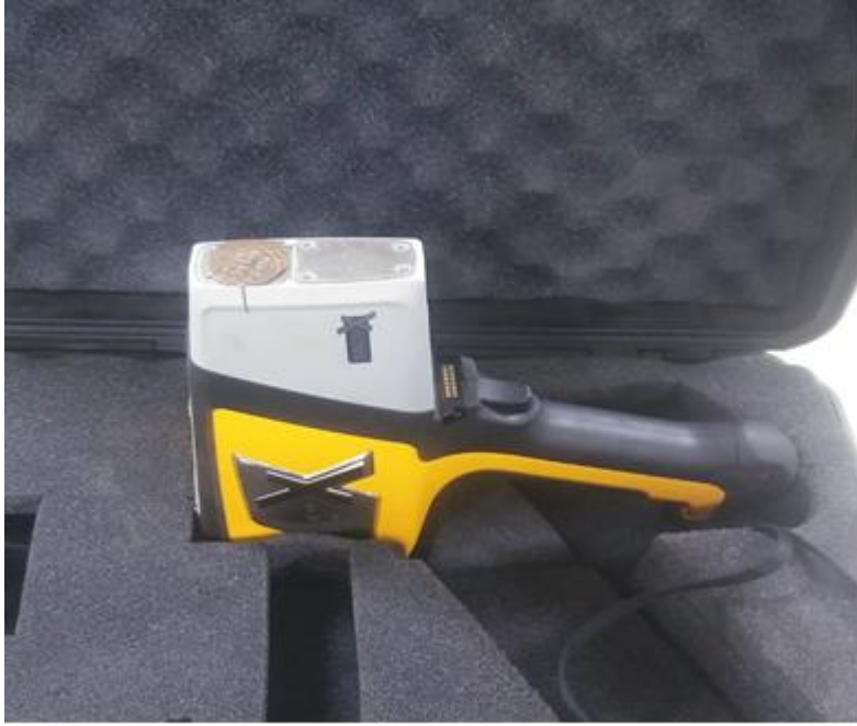
Figure 2. P-EDXRF Spectrometer

The following process steps were performed in the analysis of coins with P-EDXRF: