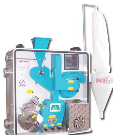
Figure 1. Rice Milling Machine

The experiments were carried on rice samples subjected to five different threshing cylinder speeds (650, 750, 850, 950, and 1050 rpm) in the combine harvester. The samples were taken from the threshed paddy for each cylinder speed, while four milling times (10, 15, 20 and 25 second) and four feed rates (20, 40, 60 and 80 gr) were used as independent parameters. The rice yield, broken kernel, bran rate, husking rate and change of color were measured for the different parameters.