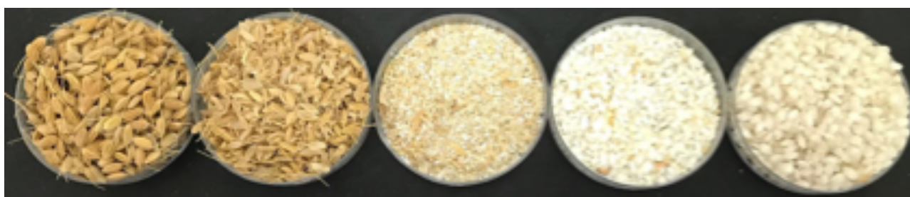
Figure 3. Rice color changes at different milling times.