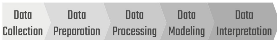
Figure 1. Data analytic process

In order to answer the data analytic questions, the study follows a process of data collection, preparation, processing, modeling, and interpretation (Figure 1). Firstly, the attribute data was designed according to the literature review. General attributes used in most of the studies and more customized attributes such as "store owners" were used. Data was collected by measuring physical attributes through Remote Sensing (RS) images in QGIS, which is an open source geographical information system software, visually analyzing qualitative attributes with Google Street Maps, and double checking data in Open Street Map Overpass Turbo API. After a normalization process, Mutual Information Matrix (MIM) and Correlation Matrix (CM) processes were conducted in Rapidminer. MIM and CM reveal positive and negative relationships between each attribute, and their dependencies.