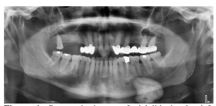
Figure 1. Panoramic image of sialolith in the left submandibular region.

A 65-year-old male patient was admitted to our hospital with the complaints of recurrent episodes of pain, difficulty in swallowing and swelling in the neck for the last 3 years. On bimanual palpation, the left submandibular gland was firm and tender, and a tender lymph node was palpated in the left submandibular region. On the panoramic radiograph, pear-shaped radiopacity with radiolucency areas exceeding the lower border of the mandible was detected at the apical level of tooth 36 (Figure 1). In the CBCT taken afterwards, a mostly radiopaque image with regular borders in the submandibular region, 28x21.29x17.64 mm in size, containing radiolucent areas compatible with sialolith was observed radiopacity (Figure 2). It was diagnosed as left submandibular sialolith on clinical basis and radiological findings. The patient was told that he needed to be surgically removed and he was directed to the relevant units. However, the patient did not accept surgical intervention.