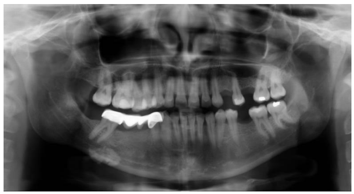
Figure 3. Panoramic image of sialolith in the right submandibular region.

In the anamnesis of the 30-year-old patient, who did not have any systemic disease and applied with the complaint of missing teeth and occasional mild pain on the right, it was learned that a feeling of dryness in the mouth sometimes occurred. A slight stiffness was felt in the submandibular region on bimanual palpation. In the panoramic radiograph taken for radiological examination, an oval-shaped opacity extending from the apical to the mesial of tooth 37 was observed (Figure 3). Cone-beam computed tomography, a three-dimensional imaging technique, was used to evaluate whether there was a tumoral formation in the bone tissue. On the tomographic image, radiopaque in the right submandibular region, with pronounced borders, 12.98x9.84x5.77 in size, consistent with sialolite, was observed radiopacity (Figure 4). The patient was informed that when he had very serious complaints, he had to be surgically removed.