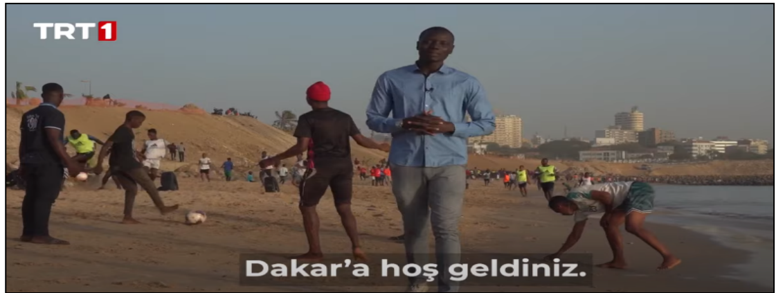
Image 12: “Sehrime Hos Geldiniz” Program Episode 11 Image ( youtube.com/c/trt1/videos )

Items to be presented include; the city's coastal area, streets, cultural elements, food, lifestyle, historical places, mosques and general views of the city are included. The program also includes negotiations with the authority of the Dakar Yunus Emre Institute. With the interactive voting, the host makes Turkish coffee and makes raw meatballs. Elhadji Loum produces raw meatballs and continues to use them for this purpose. The program comes to an end after general scenes and local music.