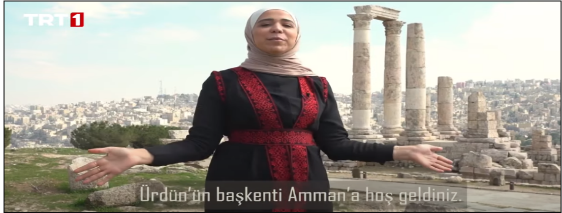
Image 14: "Sehrime Hos Geldiniz" Program Episode 13 Image ( youtube.com/c/trt1/videos )

To emphasize specifically the 13 sections examined, the "Sehrime Hos Geldiniz" program can have an international impact. Accordingly, bringing cities from different continents onto the screens and broadcasting the program on TRT 1, a global audience, could make this impact. It is therefore possible, through the existing program, that more visitors go to the promoted cities. In addition, it can be said that the program, which was held in Turkish by foreign trainees, contributed to the global impact of Turkish education.