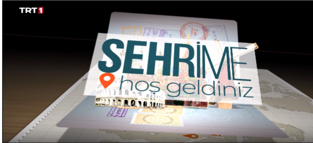
Image 1: "Sehrime Hos Geldiniz" Program Generic Image (trthaber, 2022)

questions and options to try a phenomenon belonging to Turkish culture. The program also continue with the audience's preference based on the voting results through social media. This interactive program is a first for Turkish television channels (trthaber, 2021).