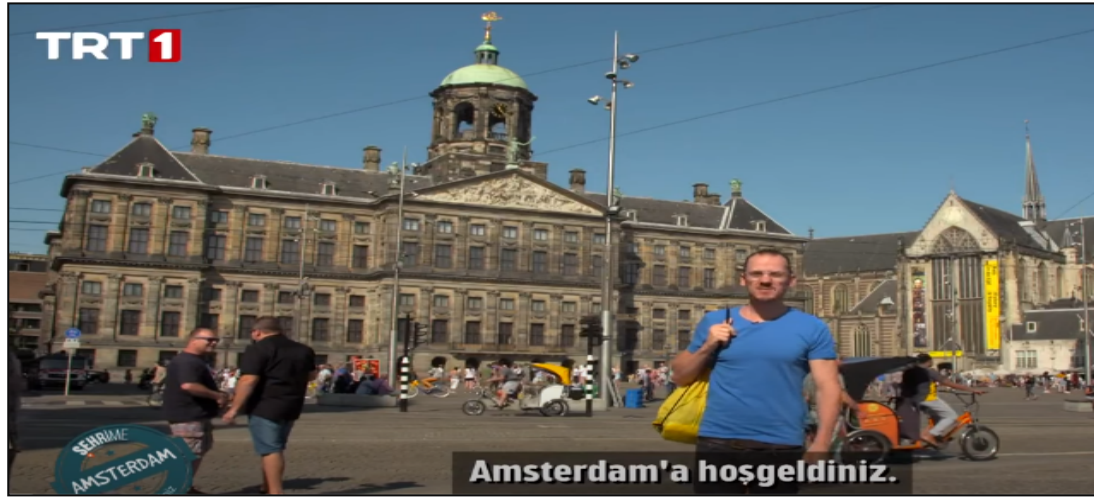
Image 5: "Sehrime Hos Geldiniz" Program Episode 4 Image

program is underway. The voting is decided towards the end of the program and the presenter will cook. This also presents the presenter's cooking scene.