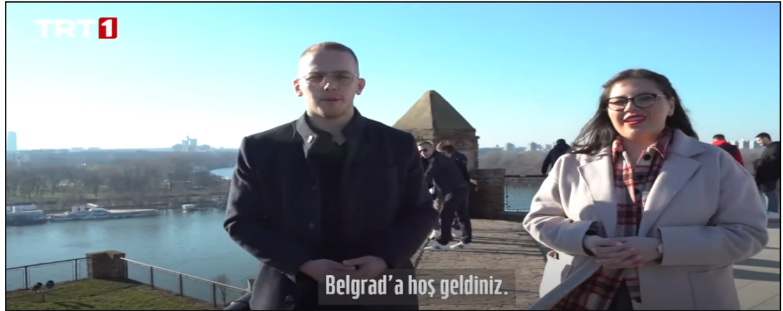
Image 13: "Sehrime Hos Geldiniz" Program Episode 12 Image ( youtube.com/c/trt1/videos )

In the interactive voting, which is another classic activity of the program, the situation of the presenters reading poetry or making marbling art is put to the vote. Since, at the end of the voting, the possibility of reading poetry was chosen more, the program continued following this action. The city stands out with its historical identity and its promotion ends following the general scenes.