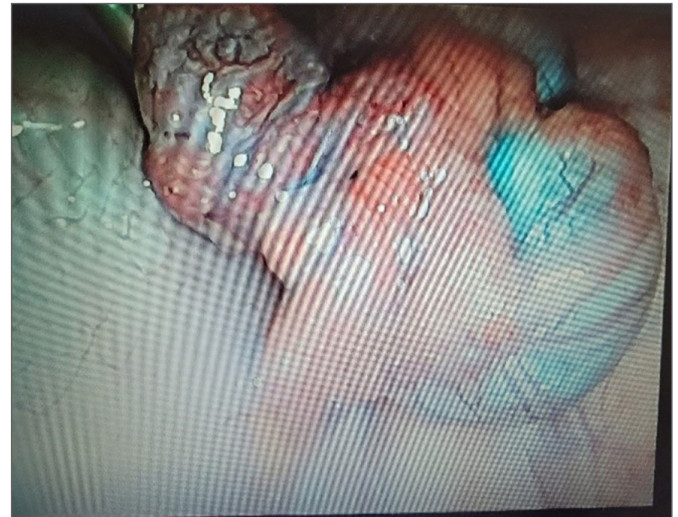
Figure 2. Control of tubal patency by methylene blue injection (methylene blue flux on the fimbria)