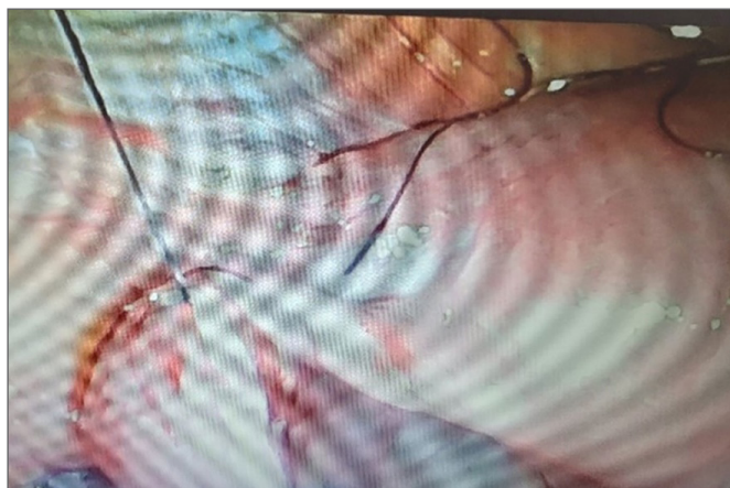
Figure 1. Proper alignment of reanastomosis was achieved by suturing separate sutures