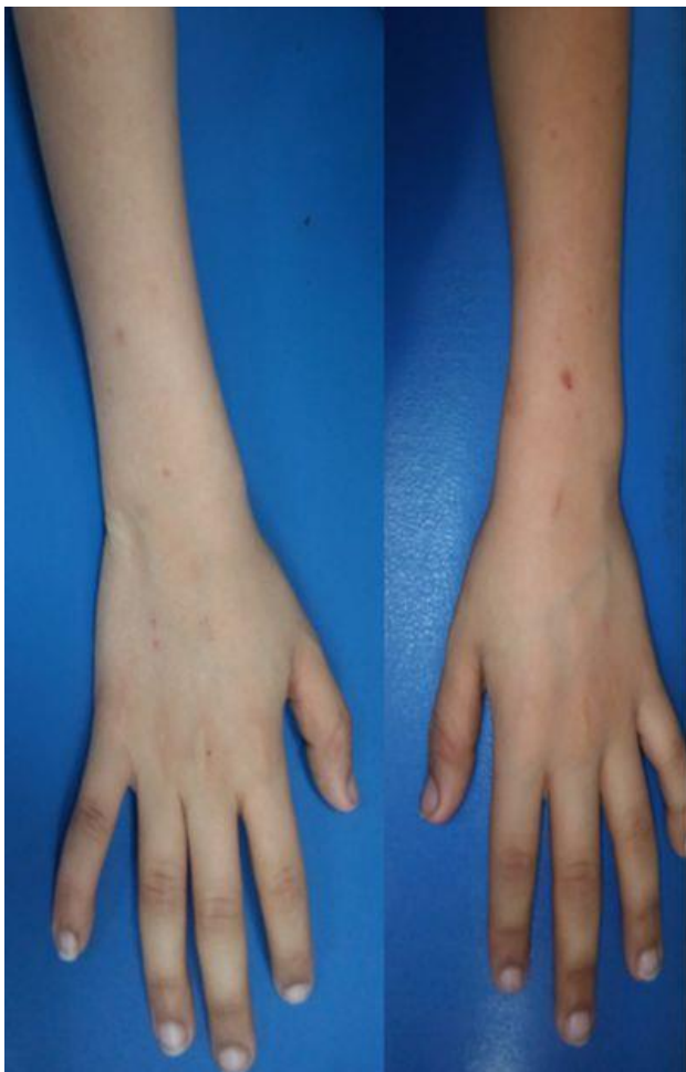
Figure 1. Discolored skin lesions on the forearms

The clinical and histopathologic pictures were more consistent with OLPC. The parents and patient were instructed that they should start a healthier diet and also refrain from consuming candies. Besides, a topical antifungal (Miconazole 20 mg/g) was prescribed for one week to clear away candidal superimposition. Afterward, topical steroids (Triamcinolone acetonide 0.1%) were