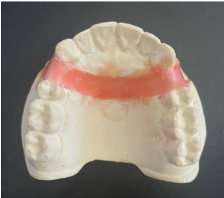
Figure 2. Model's fixation with wax after mobilization.