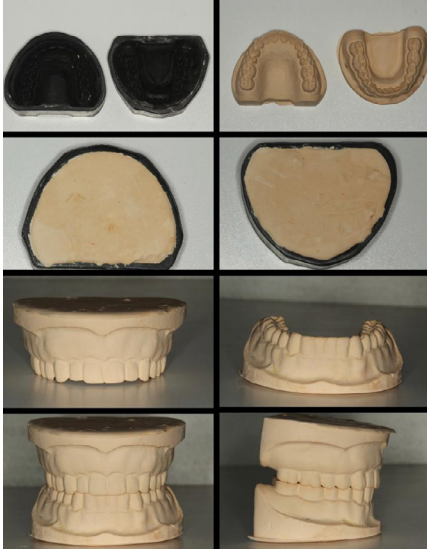
Figure 1. Preparation of plaster models from silicone-based material