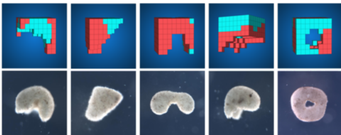
Figure 2. Shows how the samples were installed in silico and their final shape in vivo [1].

Successful designs from the previous process are then passed through a construction filter which is used to remove designs that are unsuitable for the current construction method or are not likely to be suitable for more complex processes. The success measures of this design depend on the ability of the design to reduce the minimum size of the concavity that tends to be blocked by the stem cell due to its behavior in mass engineering. The design also depends on the percentage of negative tissue (skin cells) that provides space for future organ systems or payloads.