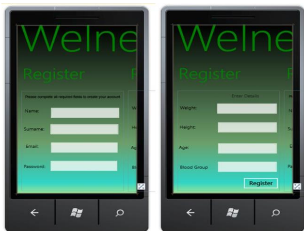
Figure 5. Interfaces of registration part

At the mobile application design part, we used visual studio as an application development editor with windows phone application design 7.1 SDK and we utilized from Dev Express for designing the interface.