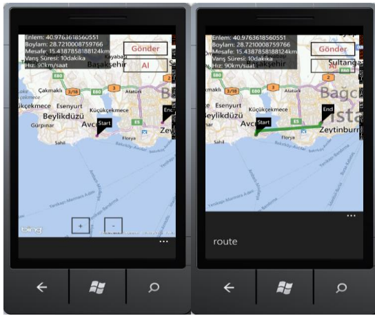
Figure 8. Location information interface

In the system, the emergency situations are listed in detail. Also, these emergency situations can be sorted according to the critical value levels, the date, etc. The details of an emergency situation can be seen together with a link on the page providing the latest health parameters of the patient.