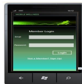
Figure 4. Interface of login part

For using our system, the user enters the system with his/her email and password which is the serial number of the device as given in figure 4. At the first entrance to the system, the user should enter his/her personal information like name, surname, age, height, weight, blood type, telephone number and address for keeping as a record as illustrated in figure 5.