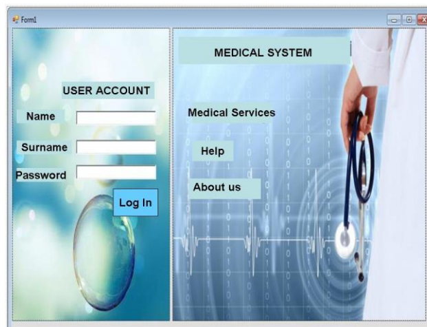
Figure 7. Hospital automation interface

In figure 7, at the left side of the interface page, user account entrance is shown with user name, user surname and user password text boxes. Here, user enters his/her name, surname and password to be able to enter the system. And at the right side of the page, system entrance, help and about buttons are placed for the users.