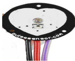
Figure 2. Pulse sensor utilized in the proposed system [11]

A microcontroller can work by itself, communicate with other electronic circuits and perform the needed functions for the application with owning definite amount of memory units and input/output ends. They may be used for collecting and processing information that are received from the sensors because of including analog-digital converters. They are small sized, low power consuming, low cost but high performance owning devices, thus they are mostly preferred in electronic technology especially in embedded systems. In our work, we used Arduino Uno R3 as a microcontroller. Arduino owns a simple I/O card and uses a processing/wiring programming language. It is an open source physical interaction platform. At each of the sender and receiver sides, a microcontroller and a software for microcontroller which is developed at processing/wiring programming language and compiled at Arduino IDE are used. Processing IDE is also used for displaying the received data at the computer. As a Bluetooth module, Arduino Bluetooth shield is used for providing the transmission of the coming data from the pulse sensor to the smart phone over microcontroller. In the proposed system heart beat rates are collected from patients by the pulse sensor which is presented in figure 2.