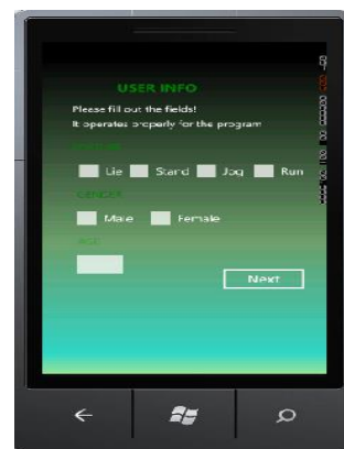
Figure 6. Heart beat rate measuring state determination interface and pulse rates of patients

SQLite and SQL Server is used as database in the system. Medical service part of the system is designed as windows form application. It is used as displaying interface of the data which is sent from the telephone to the medical service as in figure 7.