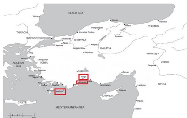
Figure 2. The location of Perge, Phaselis and Xanthos in Ancient Map [17 - 18]

The ancient city of Xanthos is located in southwest of Antalya, today's Kınık district, close to the Mediterranean shores. The city is surrounded by 2 km long walls. Archaeological excavations started in 1950 are still ongoing today. City BC It is dated to the 6th century. It came under Persian control in 546 BC, and despite this, it preserved many of its local characteristics. The most famous of these are the "column tomb". These pillar tombs are probably designed for dynasties and are pillar structures with a burial chamber, which can be decorated with carved reliefs and can weigh more than 150 tons. One of these columns carries the longest Lycian inscription, a language that has not yet been solved. Another famous tomb is the monumental tomb named as the Nereid monument and has reliefs on it [20]. This Monument is in British Museum now. Alexander the Great's conquest of Xanthos in the 4th century B.C., the city was politically completely under Greek influence. In the next centuries it presided over the Lycian federation. The city has theaters, market areas, baths, aqueducts and basilicas belonging to the Hellenistic, Roman and Byzantine periods. It is thought that the city was completely abandoned in the 12th century [20]. Also, Xanthos has been on the UNESCO World Heritage Permanent List since 1988.