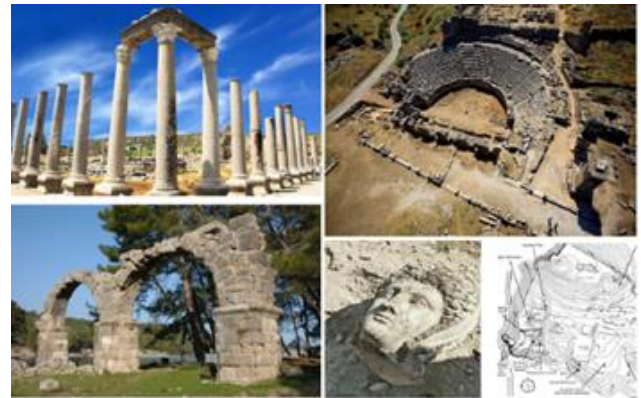
Figure 3. Some downloaded images via web-scraping for three sites (extracted by web-scraping).

Rekognition to derive the items in the web-scraped images. The following figure shows one example from the result given by the service (Figure 1).