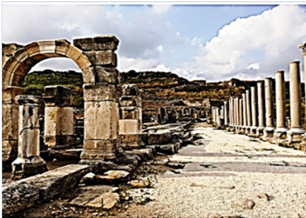
Figure 5. One example from single result-derived image