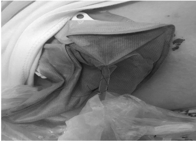
Figure 3. Stoma bag placed in the drain outlet area in order to prevent leakage around the drain, but it is seen that the leak continues from the outlet hole of the drain bag

contents, ineffective mechanisms, and ignoring patient comfort, while being performed under current conditions, the desired results are not always achieved with the mechanisms that are tried to be created.