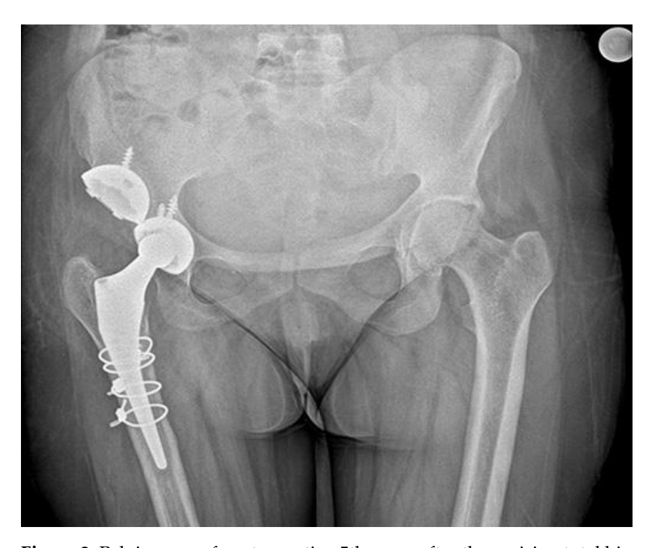
Figure 2. Pelvis x-ray of postoperative 5th years after the revision total hip arthroplasty