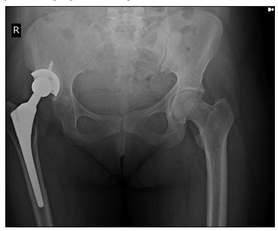
Figure 1. Pelvis x-ray of postoperative 24th months after the total hip arthroplasty, osteolysis of the acetabular cup at first operation at different center

seldom pain. There was no need to use a cane; it was possible to sit in a chair. There was no limb incompatibility between both extremities preoperatively and postoperatively. There was no infective finding in place of the acetabular component, which was left in place during the intraoperative period. Acute phase reactants were normal both preoperatively and postoperatively. The walking distance had increased significantly, up to 10 times. The Harris hip score score was 85.55. The patient had no complaints in the 5th year following (Figure 2). No complications occurred.