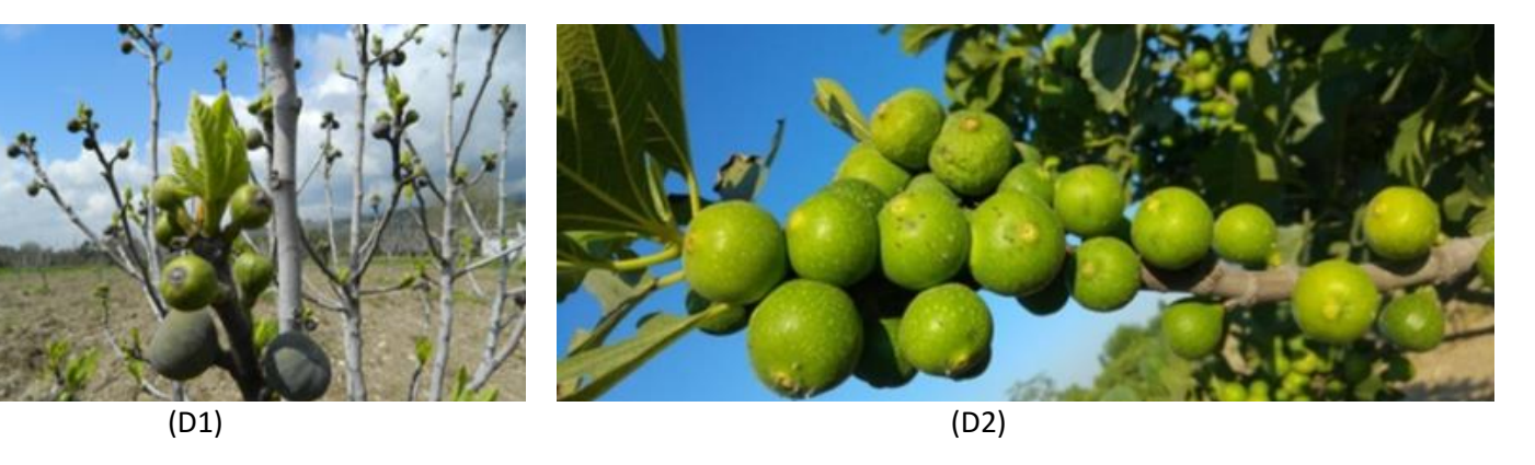
Figure 2. Phenological observation studies (A), mamme fruits on the branch (B1, B2), onset of leafing (C1, C2) and newly formed profichi fruits (D1, D2)