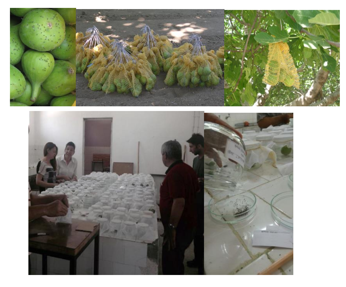
Figure 4. Healthy profichi fruits, Blastophaga pseneses L. counting and emergence times observations