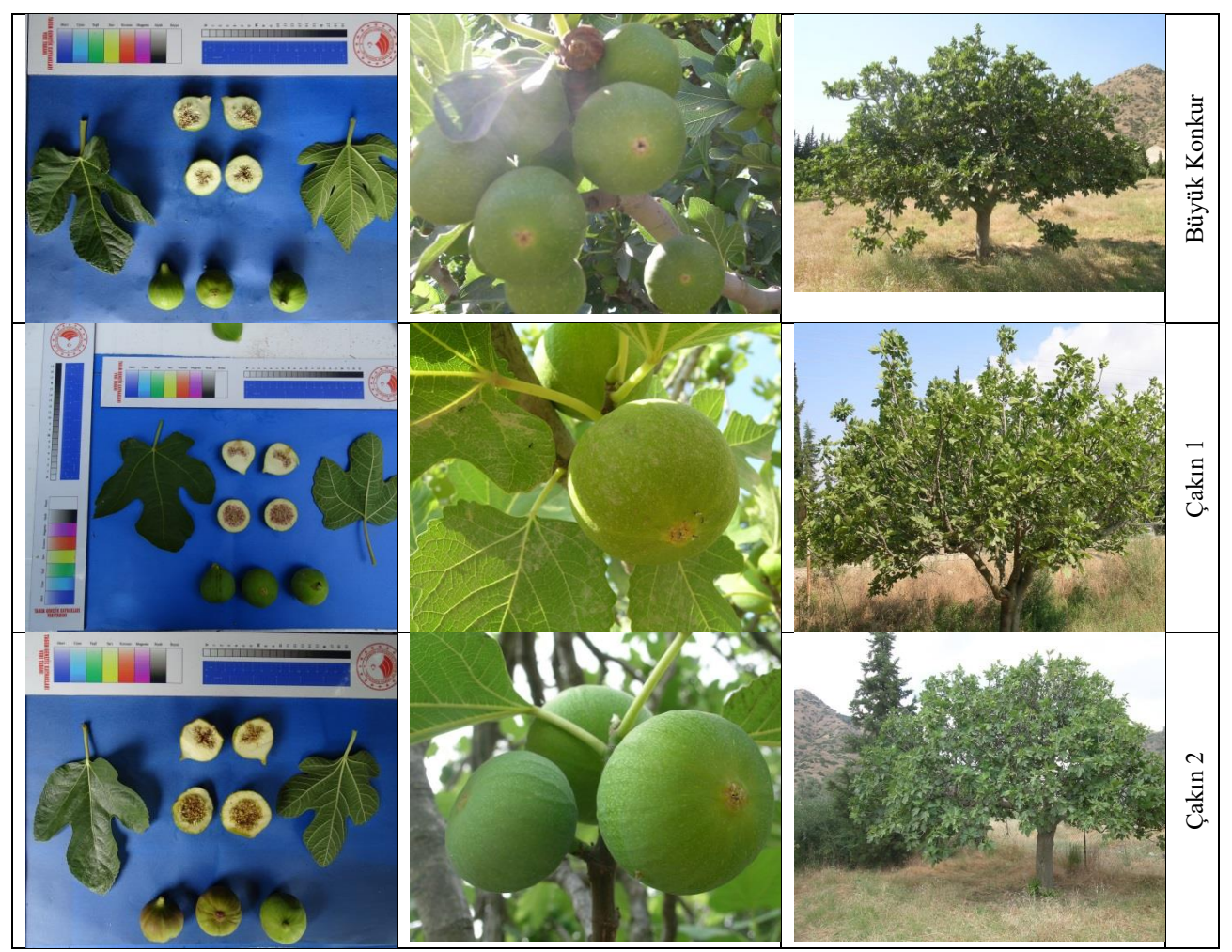
Figure 7. Sections of fruit and fruit on the branch and tree growth habit photos of some caprifigs