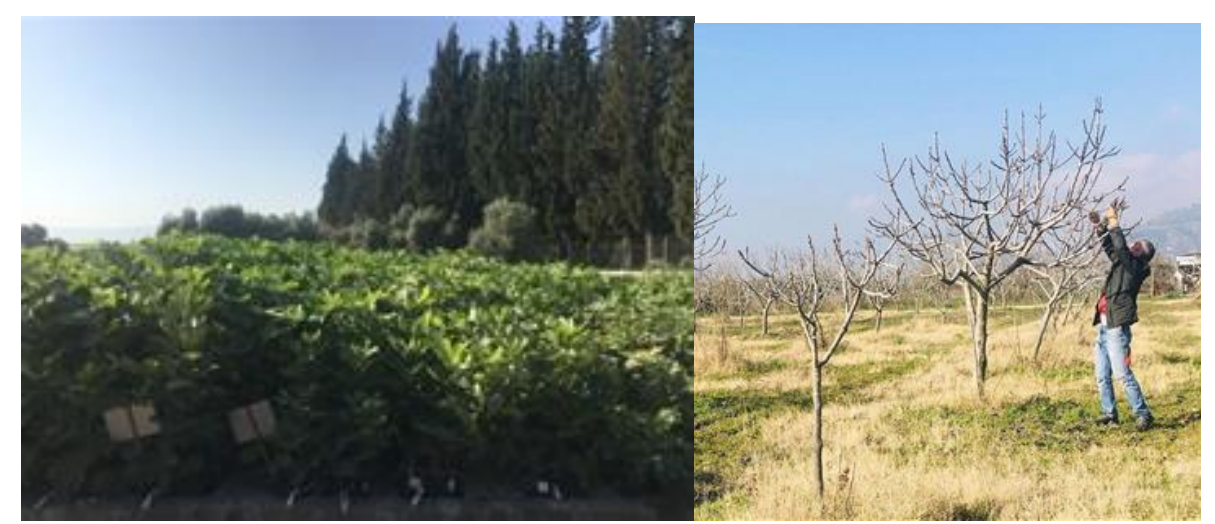
Figure 5. Production and planting of saplings of genotypes that are missing in the collection for any reason

Every year, instead of the genotypes that dry out for any reason in the collection, their cuttings are taken, and their saplings are produced and planted. In this way, renewing the collection and continuing the conservation program in the project (Figure 5).