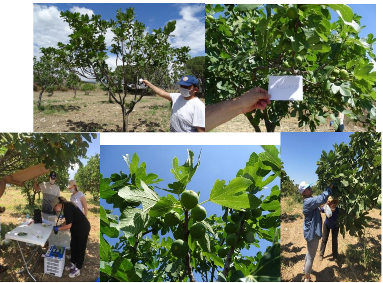
Figure 6. Photography and archive studies on male fig fruits and trees

In addition to the characterization and documentation information of the caprifig field gene bank to be passed on to future generations, the status of fruit sections, trees, and fruit branches of genotypes were recorded with photographs (Figure 6). As an example; the cross-section of the fruit, its condition on the branch and tree growth habit photos of some genotypes were given in Figure 7.