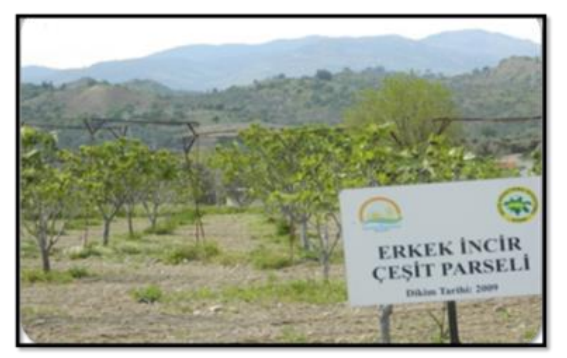
Figure 1. Male fig (caprifig) field gene bank (planted date:2009)