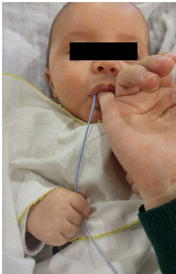
Figure 2: Our second case (Picture was taken and shared upon family's approval)

to breastfeed with complementary feeding until 27 months of age (Figure 1).