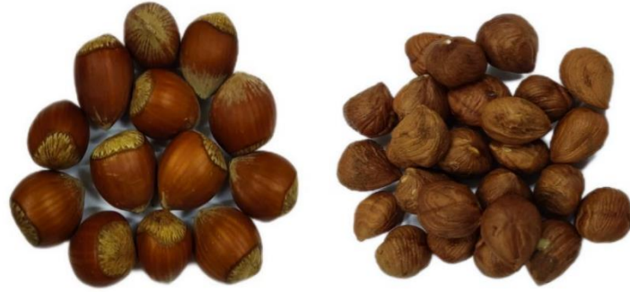
Figure 1. Samples of the shelled and kernel of the Foşa hazelnut cultivar. Şekil 1. Foşa fındık çeşidinin kabuklu ve iç örnekleri.

In this study, Çakıldak and Foşa hazelnut fruits were harvested from a farmer's garden in Samsun in the 2021 season. Çakıldak cultivar, on the other hand, has been used because it is a cultivar that is produced quite a lot in Turkey and has a high yield. Engineering characteristics of hazelnut vary according to the cultivar. Foşa hazelnut is one of the first cultivars that comes to mind when it comes to hazelnut cultivars, as well as a large and flamboyant cultivar in Türkiye. While the bark of the Foşa cultivar is darker, on the contrary, the bark of the Çakıldak cultivar is lighter. Hazelnut fruits were brought to Tokat Gaziosmanpaşa University, Faculty of Agriculture, Biosystem Engineering Department as soon as possible. Some engineering characteristics (geometric and volumetric properties, colour properties, static friction coefficient and mechanical behaviors) were determined in the Biological Material Laboratory. Damaged and broken fruits were excluded from the experiments. Foşa and Çakıldak hazelnut samples used in this experiment for shelled and kernel are presented in Figures 1 and 2, respectively.