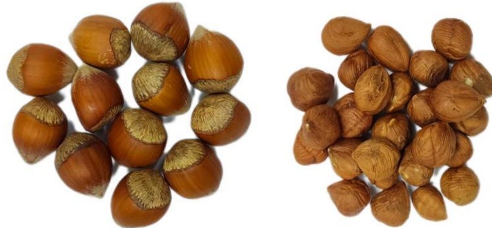
Figure 2. Samples of the shelled and kernel of Çakıldak hazelnut cultivar. Şekil 2. Çakıldak fındık çeşidinin kabuklu ve iç örnekleri.

To determine some geometric and volumetric characteristics of shelled and kernel hazelnut fruits, 100 fruits were used. The size dimensions of hazelnut samples were determined with a digital caliper (with an