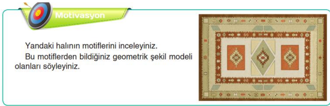
Figure 1. Geometric Objects on a Carpet Pattern.

At the 5th grade level, in the MEB publisher, in the chapter 3 in the area of Geometry and Measurement learning, there was a culture emphasis in the cities on the map activity on area measurement, and in the aircraft mechanics activity in the decimal representation in the Chapter 3 in the Numbers and Operations learning area while at Koza Publisher, there is an event in which cultural relations are held on triangles and quadrilaterals in the third chapter of the Geometry and Measurement learning area. Under the motivation title, there is a section where ethnic carpet patterns are found and the student wants to comment on it (Figure 1).