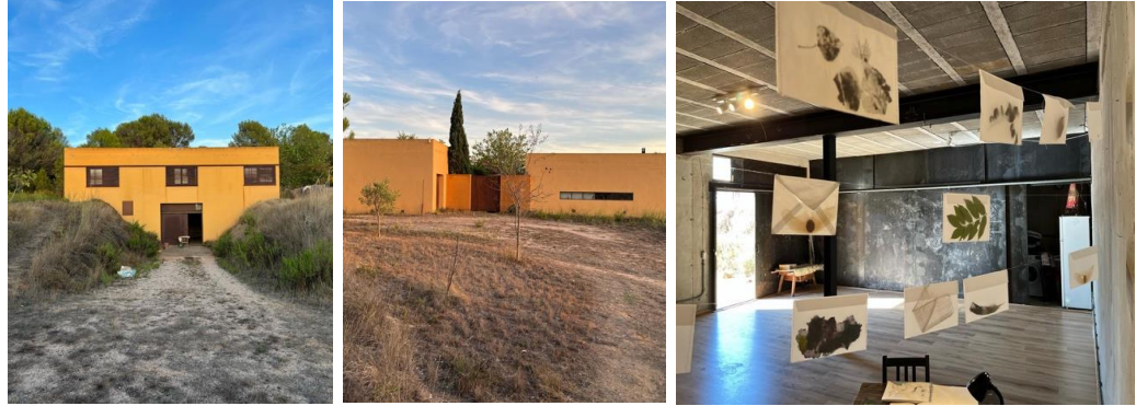
Image 4. Nau Coclea's modular structure, in which areas such as studios, galleries, houses and gardens are moved or intertwined from time to time.

artist because people fell into the sleep of media and capitalism and therefore art was different from the monotony of this daily life.