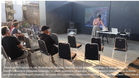
Image 2. Jatiwangi Art Factory, 13'45" documentary video "Uçan Kanatlı Tohumların Peşinde"