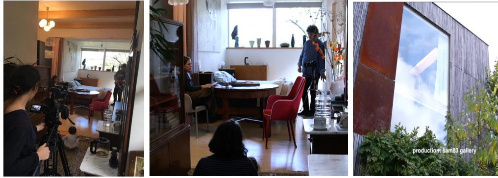
Image 3. "AiC Česka Břiza heARTbreaker 2021, 6'10 " video

Sam's long-standing project "A vision for a new culture and its place" is motivated by the desire to remove all artificial frameworks that create mental discomfort for a person. Setting up a gallery in Česká Břiza is one of the ways to overcome prejudices (Sam83, 2023) In this sense, the word of the art production and presentation space as an art form is important: