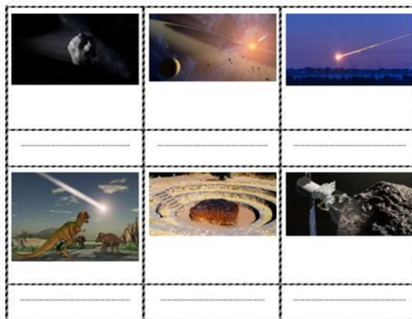
Figure 1. Storyboard view of the Asteroid Belt event

Engagement: The digital story called “Asteroid Belt” is opened on the smart board and watched by the class. Students write down the information they heard in the story under the pictures on the storyboard.