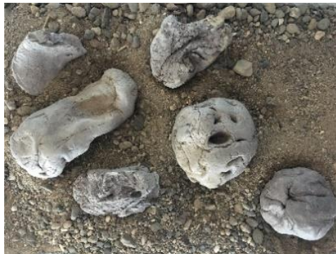
Figure 2. Pieces dropped in the sand

Elaboration: During the exploration phase, the largest pieces scattered around by the impact of collision are selected and left on the sand in a transparent bucket from afar. The shapes formed on the sand are evaluated in terms of size and depth.