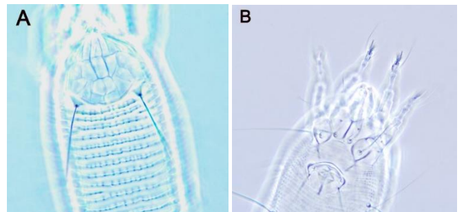
Figure 4. Aculus taihangensis – Male: A. Prodorsal shield and part of dorsal opisthosoma, B. Coxigenital region.

Figure 4: Scanning electron micrographs of Aculus taihangensis male. Panel A shows the prodorsal shield and part of the dorsal opisthosoma, showing the arrangement of lines and setae. Panel B shows the coxigenital region, highlighting the genital coverflap and associated structures.