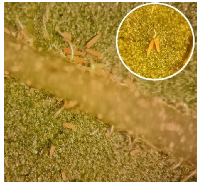
Figure 5. Dense aggregation of Aculus taihangensis along the midrib of a leaflet of the tree of heaven.