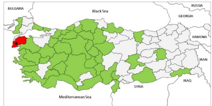
Figure 1. Map of Türkiye showing the provinces from which leaf samples were collected from the tree of heaven in 2022 and 2023 (* indicates the site in Çanakkale Province at which the eriophyid mite, Aculus taihangensis , was collected).

E31SPM20000KPA). The examined specimens are in the mite collection of the Acarology Laboratory, Department of Plant Protection, Faculty of Agriculture, Ondokuz Mayıs University, Samsun, Türkiye.