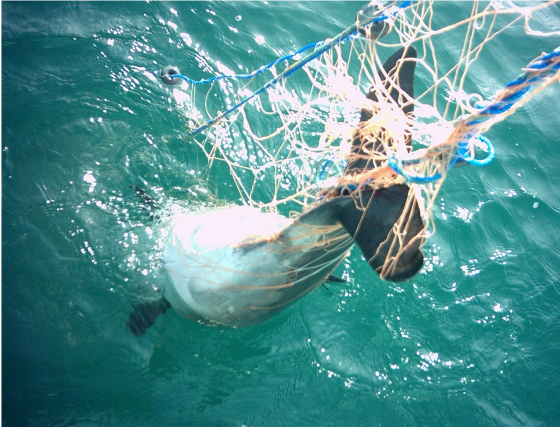
Figure 1. Bycatch of dolphin in turbot gillnet (original) ( Phocoena phocoena )