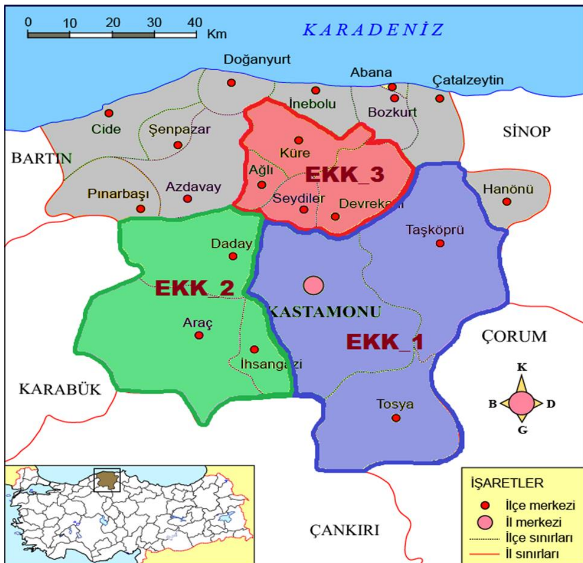
Figure 2. Kastamonu Province Economic Development Clusters (EDC) (KITOM, 2021).

Considering the 2004 Kastamonu Provincial Agricultural Master Plan and the similarities and differences between the districts, the study area of Kastamonu was divided into 3 Economic Development Clusters (EDC). These Economic Development Clusters are shown below as follows;