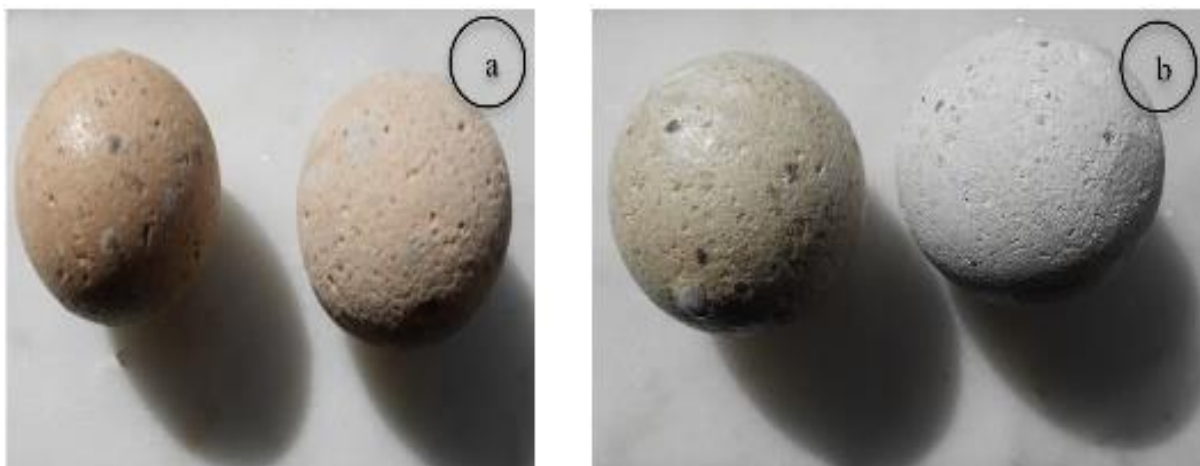
Figure 1. The images of pink and white tuffs. (a) Pink tuff (b) White tuff