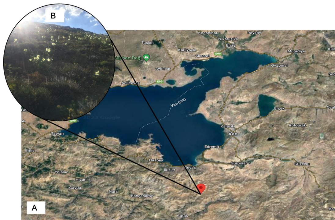
Figure 1. The location where the plant was collected (A) and the natural distribution of A. calvertii (Boiss.) Boiss. in the area (B)