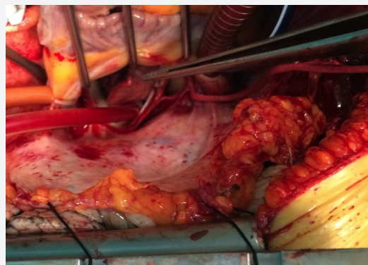
Fig. 2. Thrombus on the mitral valve

A 67-year-old woman presented with progressive shortness of breath, swelling in the legs. She had a prior history hypertension and mitral valve replacement with mechanical valve in 2007. A transthoracic echocardiogram was performed. 2.3 cm 2 cm and highly mobile mass relevant with the mechanical valve was revealed. Mitral valve and thrombus (Fig. 2) was excised and replaced with 29 no bovine bioprostheses valve (St Jude, Bioprotheses, Minn. USA). The patient was discharged home 7 days later with oral warfarin therapy.