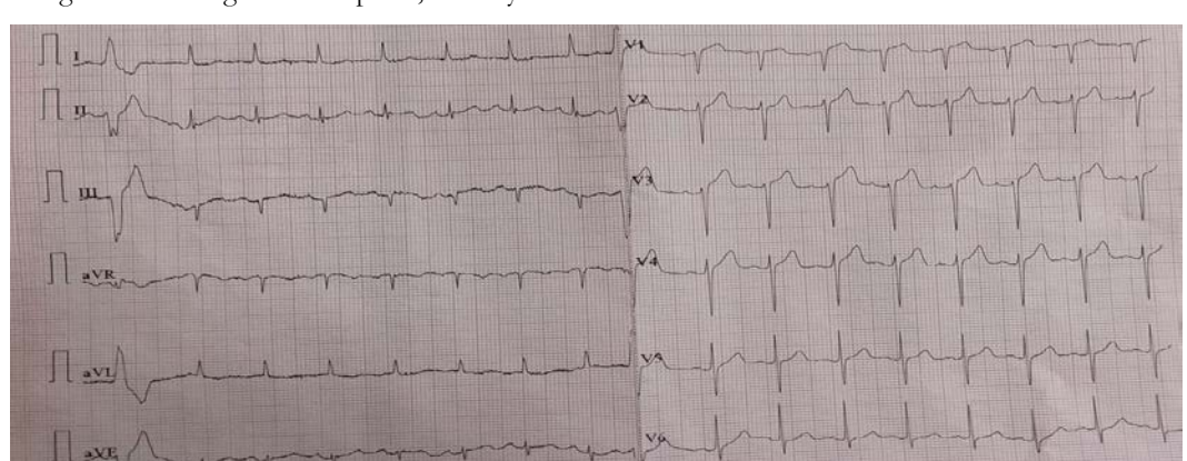
Figure 1 First ECG record of the patient with dizziness complaint

male patient admitted to the ED with dizziness followed by a fall. It was learned that it was not high-energy fall but resulted in a mild head injury. He was alert, oriented, and able to communicate well. His vital signs were as follows; blood pressure: 140/80 mm/Hg, heart rate: 140-150/min, blood sugar:135, SpO2:96. Brain CT scan was evaluated as normal. On the ECG, which was recorded for the etiology of dizziness, suspicious ST segmental elevation between 1-2 mm in the chest leads was observed (Figure 1). The patient inquired about the presence of chest pain. It was learned that even though he had chest pain occasionally, it had passed and he reported no chest pain today.