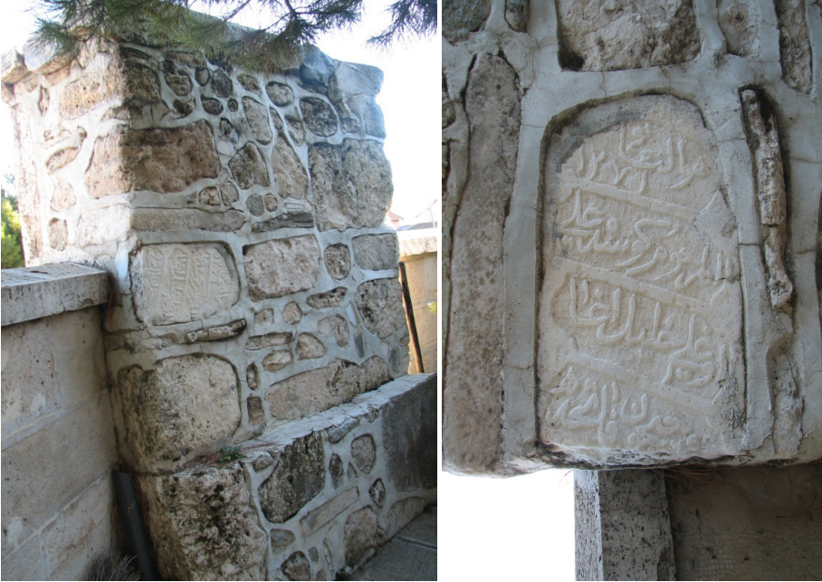
Photo 3-4. Hacım Village, Aslanlı Çeşme. Tombstone on the back wall of the fountain.