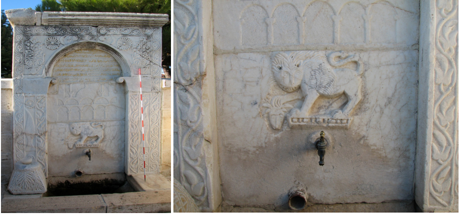
Photo 1-2. Hacım Village, Aslanlı Çeşme (Photographs and drawings belong to the author).

with the mains water, shows that the cement-containing plaster structure at the bottom of the marble ornamental slab of the fountain is undergoing repair. The fountain, of which the front facade is marble was built with pitch-faced stone, ends with a plat band marble eaves.