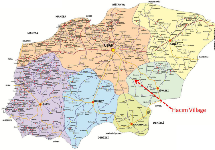
Map 1. Uşak Province Map (Uşak Municipality).

of the study, the fight scene in Aslanlı Çeşme is introduced, and in the next section, the symbolic meaning of the fight scene is dwelled on with similar examples.