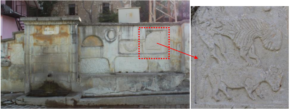
Photo 5-6. Byzantine period spolia plastic on the retaining wall where the fountain is located opposite the mosque in Karakuyu Village.