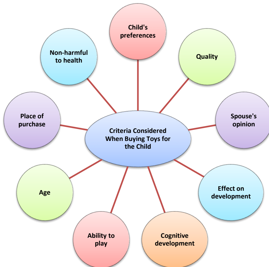
Figure 1. Factors Regarding Toy Selection.

During the interviews with mothers and fathers, they were asked about the criteria they consider when buying toys for their children, and the responses were analyzed to determine the criteria they pay attention to, as shown in Figure 1.