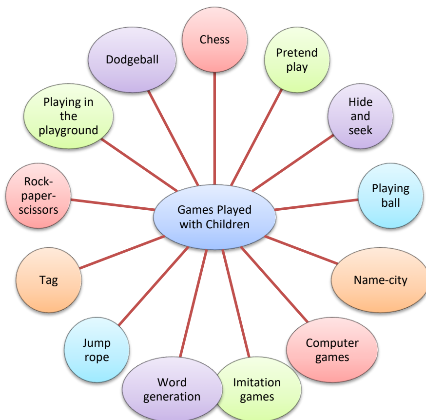
Figure 3. Games Played by Parents with Their Children.

Parents were asked about the criteria they consider when playing games with their children, and the responses are provided in Figure 3.